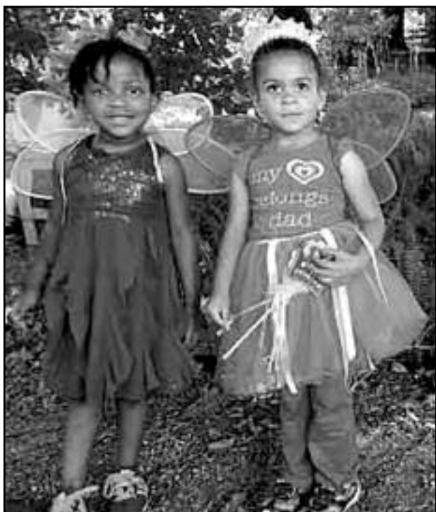
(above) Join the fun at the 13th Annual Fairy Day at Frelinghuysen Arboretum on Sunday, June 23, from 1 p.m. to 3 p.m.