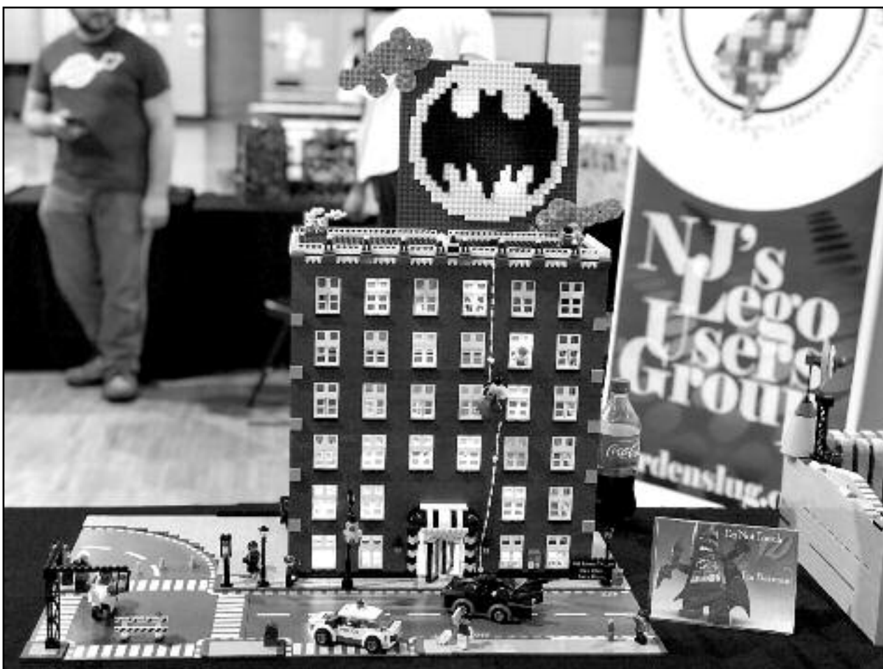
(above) Creation on display during Lego Night at Irene E. Feldkirchner Elementary.