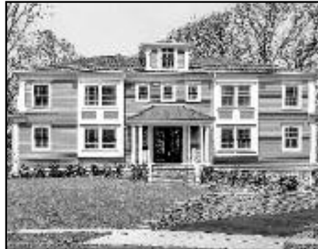
14 Amy Drive, Westfield Offered at $1,650,000