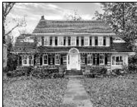
867 Bradford Avenue, Westfield Offered at $1,395,000