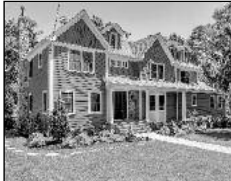
110 Wychwood Road, Westfield Offered at $1,599,000