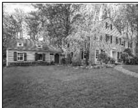
295 Watchung Fork, Westfield Offered at $1,498,800