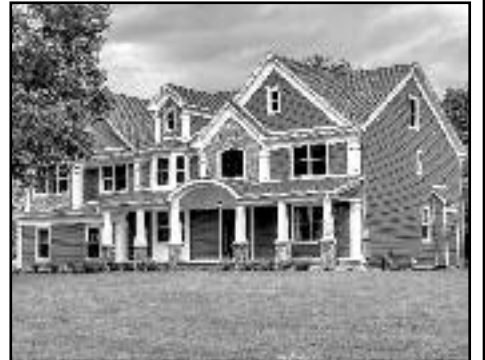
12 Stoneleigh Drive, Scotch Plains Offered at $1,499,900