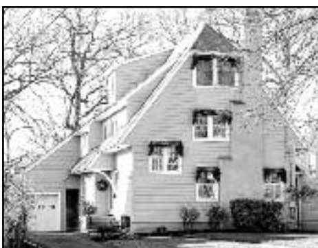
525 Fairmont Avenue, Westfield Offered at $850,000