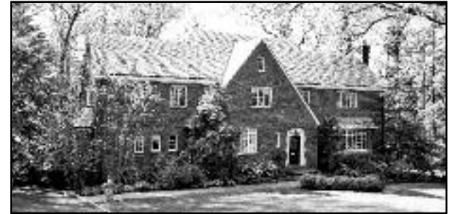
Return to jazz age elegance in this stately 1920s manor home on one of Westfield's most desirable streets. Recently rethought, renovated and updated for a young family, the stylish interiors are relaxed yet sophisticated, with dark chestnut trim, mirrored furnishings and rich gold and grey accents.

call 908 232 9400 or visit the Friends of NJ Festival Orchestra on Facebook.