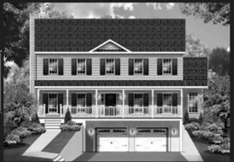
WESTFIELD, NJ $1,199,000