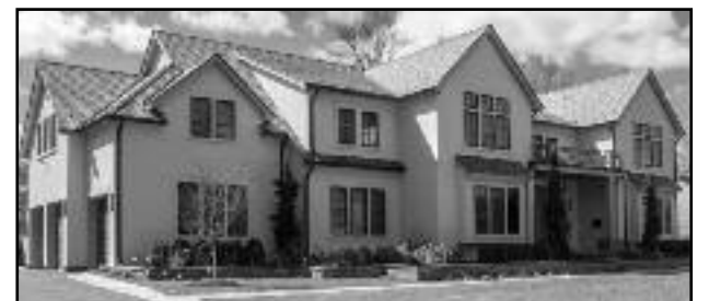
The magnificent stylized furnishings and eclectic artwork of this recently constructed residence combine to give the home a feeling of open elegance as well as a sense of comfortable family living. A modern must-see in one of Westfield's prime neighborhoods!