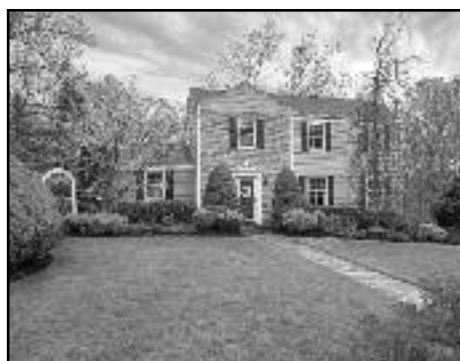
352 Ackerman Ave., Mountainside Offered at $650,000