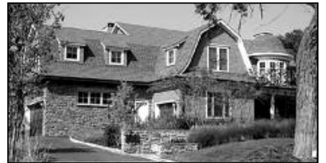
Designed and built by an environmentally-conscious architect, this superb home showcases a dedication to leaving a minimal environmental footprint. The construction used recycled, energy-efficient and eco-friendly materials, reclaimed lumber for floors and ceilings, and reused antique windows and staircase.