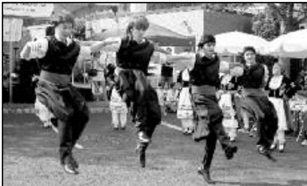
Photos of NJ Greek Fest 2018 Photos from this and other events can be found online at rennamedia.com and on the Westfield Monthly page on facebook.com.

Holy Trinity Greek Orthodox Church is located at 250 Gallows Hill Road in Westfield. Street parking and a free shuttle are available. For more information on NJGreekfest, call (908) 233-8533, visit www.njgreekfest.com , or follow us on Facebook and Instagram at NJGREEKFEST. For more information on Holy Trinity Greek Orthodox Church and our ministries, visit holytrinitywestfield.org .