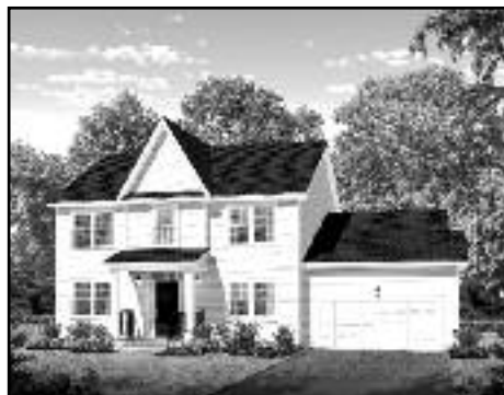
1115 Summit Avenue, Westfield Offered at $1,349,000