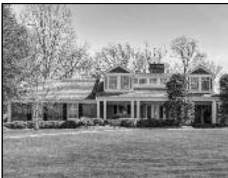
2 Breeze Knoll Drive, Westfield Offered at $1,395,000