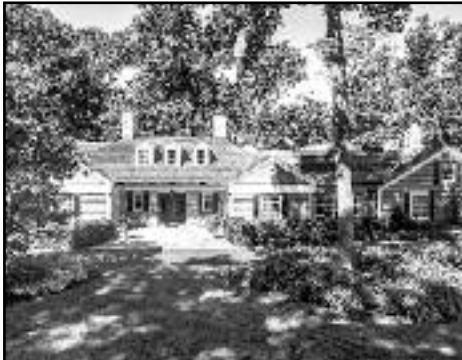
101 Golf Edge, Westfield Offered at $2,500,000