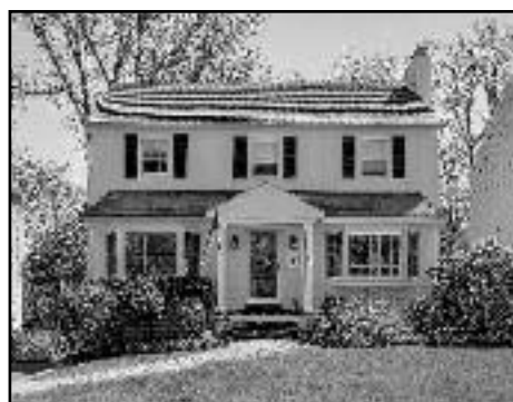
451 Channing Avenue, Westfield Offered at $699,000