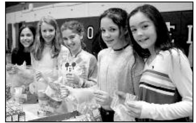
(above) Roosevelt Intermediate School students assemble snack packs for the Rotary Club backpack initiative, which helps children.