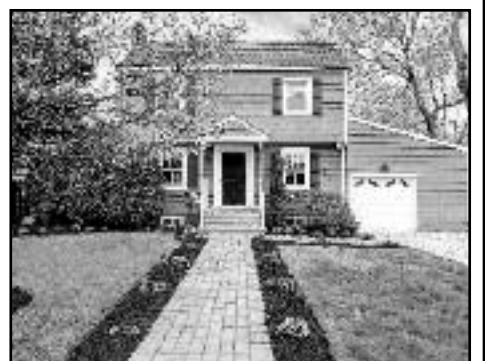
202 Elizabeth Avenue, Cranford Offered at $535,000