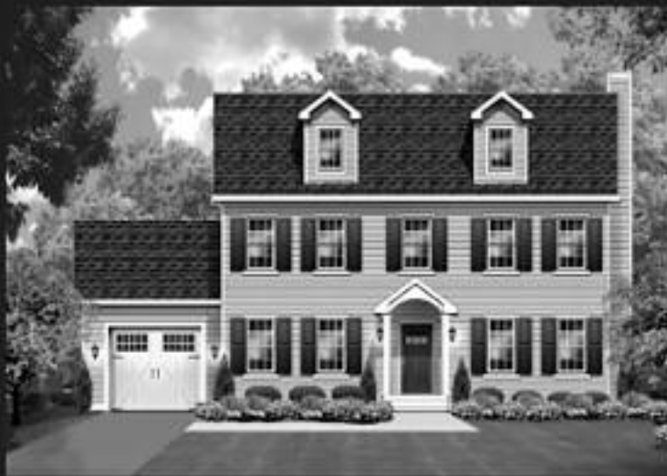
WESTFIELD, NJ $899,000