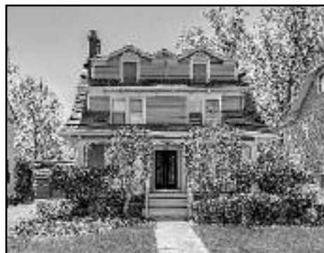
715 Highland Avenue, Westfield Offered at $1,195,000