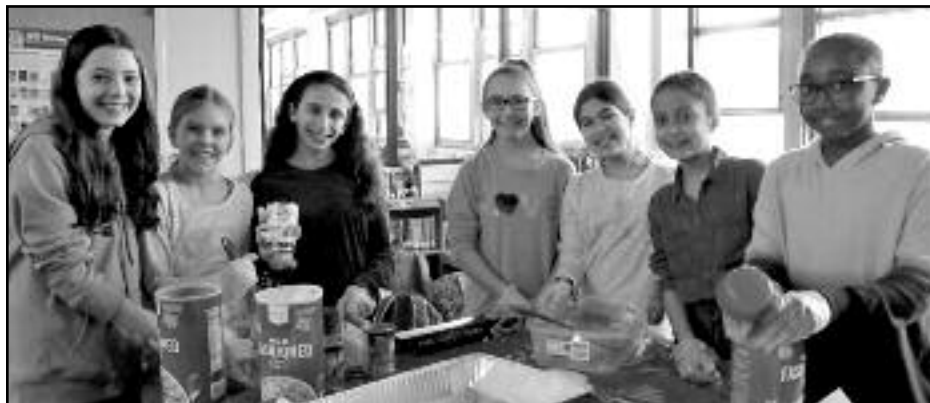
(above) Students at Edison Intermediate School make dog treats for local animal shelters as part of a districtwide Community Service Week in Westfield Public Schools.