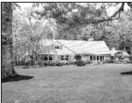
315 Wychwood Road, Westfield Offered at $1,199,000