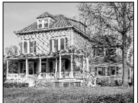
128 N. Chestnut Street, Westfield Offered at $1,245,000