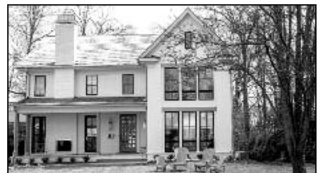
This Southside new custom construction stands in a class of its own. The home reflects organic, fresh, indoor/outdoor West-Coast living, merging a relaxed, lived-in, layered aesthetic with impeccable architecture, workmanship and high-end natural finishes.