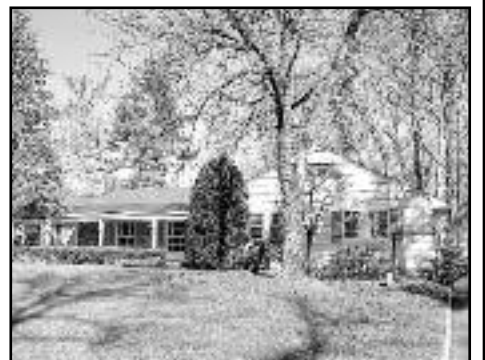
940 Wyandotte Trail, Westfield Offered at $995,000