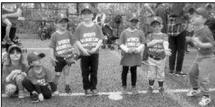
Spencer savings Bank