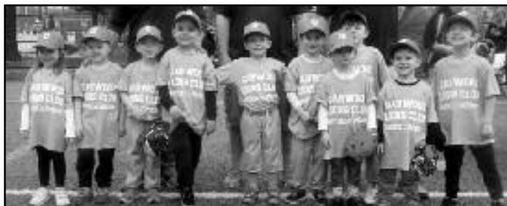
Gaewood Lions' Club