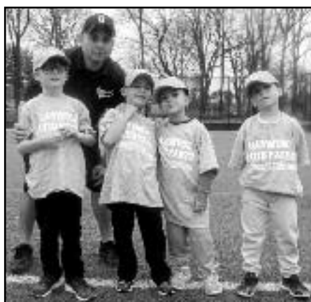
Garwood Auto Parts