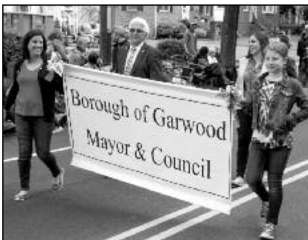
(above) 2018 Cranford Memorial Day Parade

The parade will assemble at 8:30 a.m. at the Cranford Community Center, 220 Walnut Avenue, Cranford, New Jersey. Marching will start at 9 a.m. The parade will finish with services at approximately 10 a.m. at Memorial Park on Springfield Avenue. In case of inclement weather, services only will be held at the Community Center.