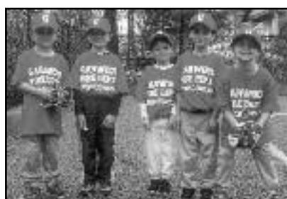
Garwood Fire Department