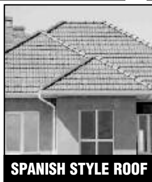
SPANISH STYLE ROOF