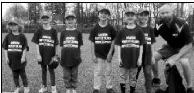
Garwood Knights of Columbus

Kenilworth and Roselle to offer programs to their youth as well as Garwood youth. Age Ranges: 4-5-yr's will play tee-ball, 6-7-yr's will play coach pitch baseball, and 8-yr's will play on appropriate baseball/softball teams as their skill level determines.