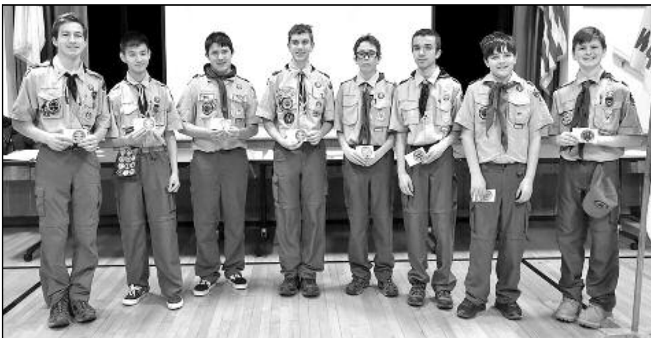
(above) Current Scout Leadership receives their position patches at the Winter Court of Honor on February 4, 2019.

Any boy 11 through 18 is welcomed to come join our troop. Please email troop228warren@gmail.com with any questions and stop by our weekly Monday evening meetings.