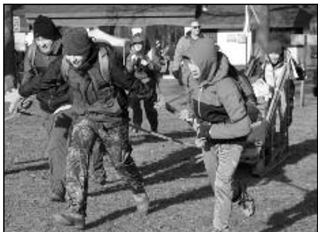
(above) Boy Scout Troop 228 races off at the start of the Watchung Mountain District Klondike Derby on January 26, 2019.