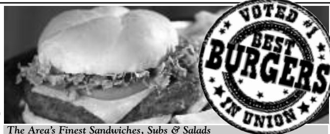
The Area's Finest Sandwiches, Subs & Salads