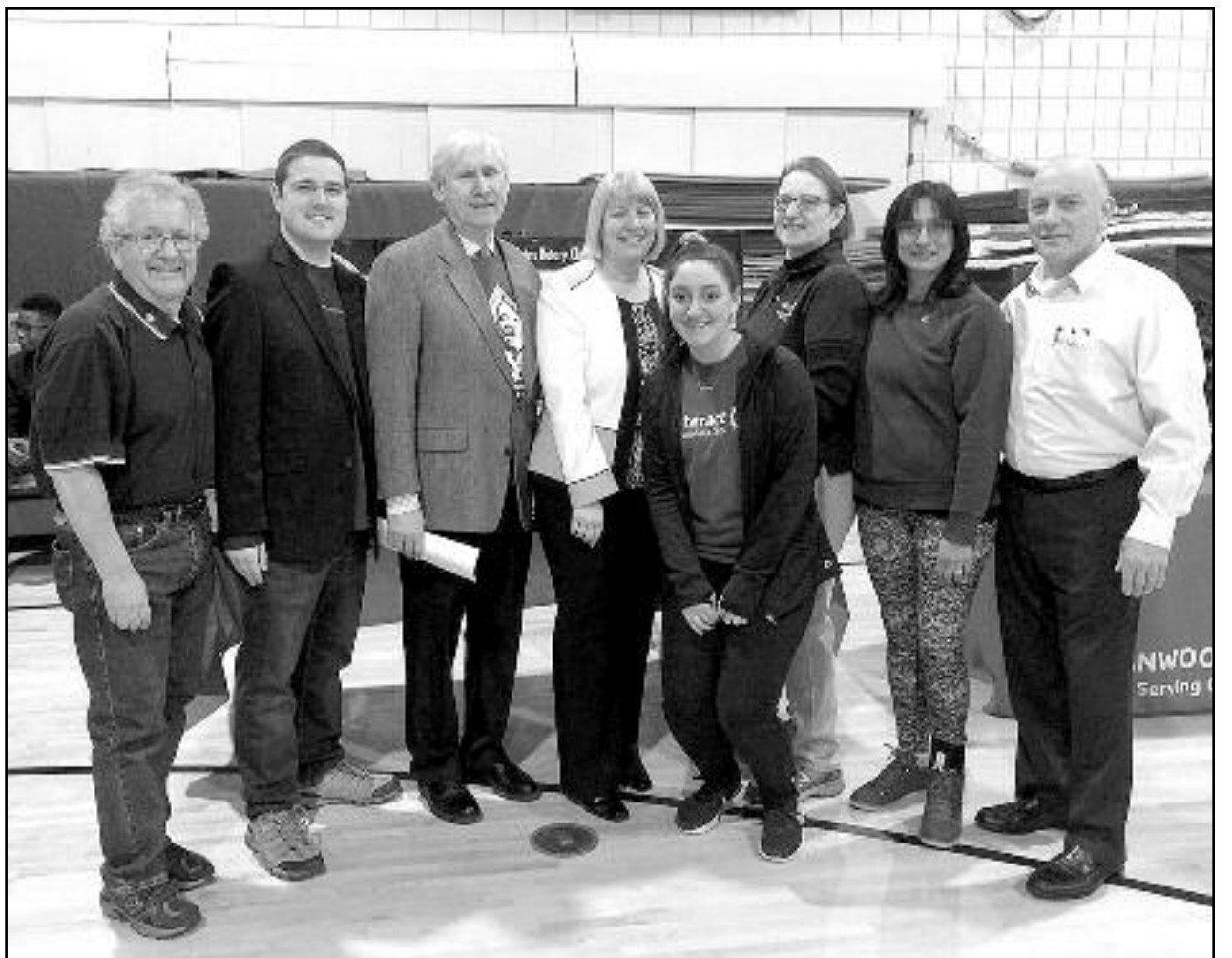
(above) The Fanwood Scotch Plains Rotary Club sponsored 'Rise Against Hunger' which is driven by the vision of a world without hunger. Their mission is to end hunger in our lifetime by providing food and life-changing aid to the world's most vulnerable. Volunteers packed 10,000 meals in an assembly-line of highly nutritious dehydrated meals comprised of rice, soy, vegetables, and 23 essential vitamins and minerals.