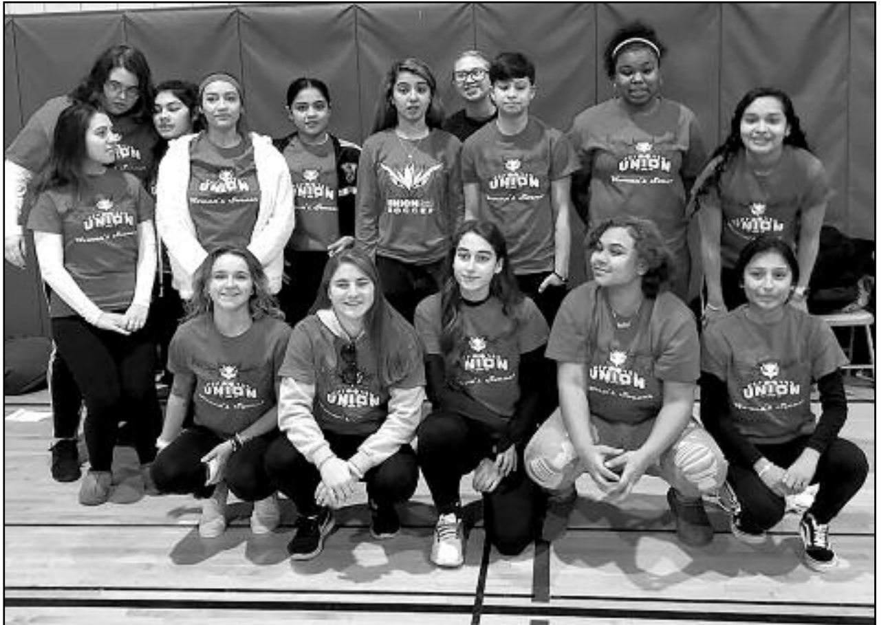
(above) The Union County College Soccer Club volunteered for the 'Rise Against Hunger' meal packing effort held at the YMCA.