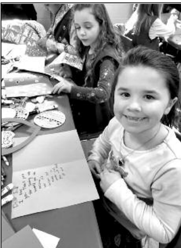
Valentines for Veterans (above) Brownie Troop 40782 made Valentines for Veterans.