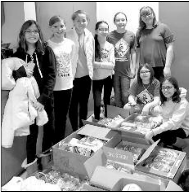
Sandwich Making for the Hungry (above) Girl Scout Troop 40091, 6th graders from Terrill Middle School, made about 1,000 sandwiches which were distributed to several area soup kitchens. Members of the community donated the items to make the meat and cheese sandwiches.

Fanwood and Scotch Plains including JCC of Central NJ, Goddard School, Fanwood Presbyterian Church, St. John's Baptist Church, Willow Grove Presbyterian Church, Temple Shalom, All Saints Episcopal Church and the YMCA.