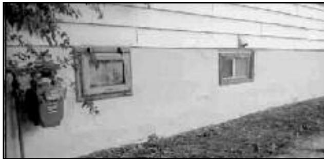
FOUNDATION REPAIRS BEFORE & AFTER