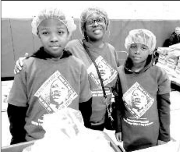
(above) The Hunter family of Scotch Plains