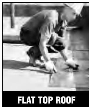
FLAT TOP ROOF