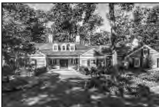
101 Golf Edge, Westfield Offered at $2,500,000