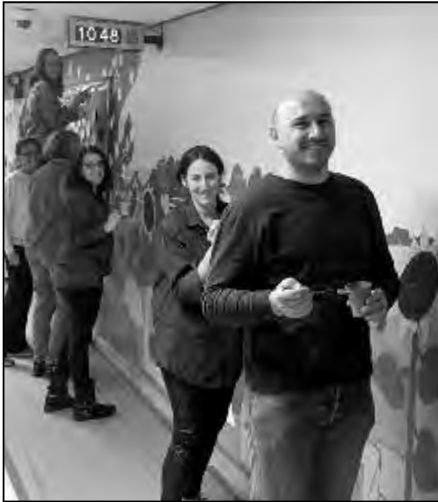
(above) Second and third graders at Jefferson Elementary School recently joined parent volunteers in transforming school hallways into a magical scene of the many events that take place each year.