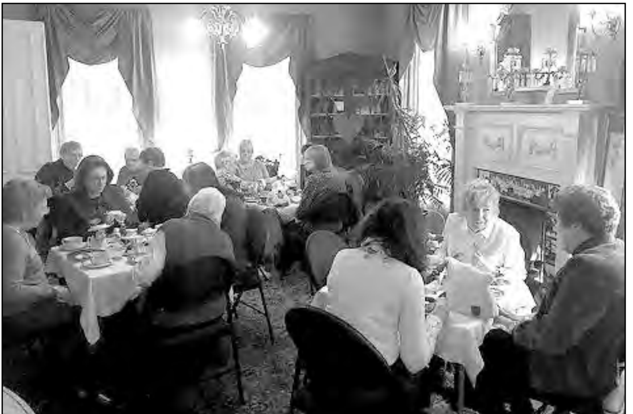
(above) Guests enjoy a past Edwardian Tea Luncheon to be held again at the Westfield Historical Society's Reeve House on February 6th. Reserve early as space is limited.

Since 1968, the 501(c)(3) non-profit Westfield Historical Society has worked to preserve, interpret and encourage interest in history, Westfield, and its residents through educational efforts and community outreach programs.