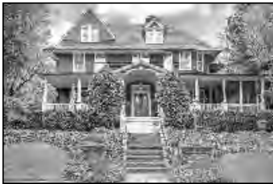
416 Elm Street, Westfield Offered at $1,195,000