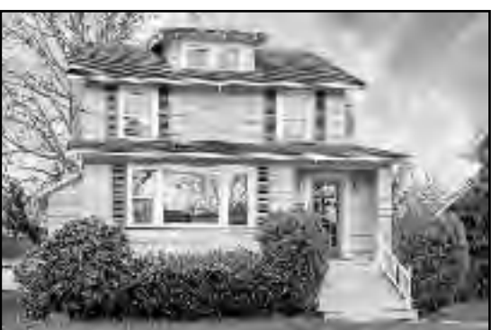
805 Embree Crescent, Westfield Offered at $525,000