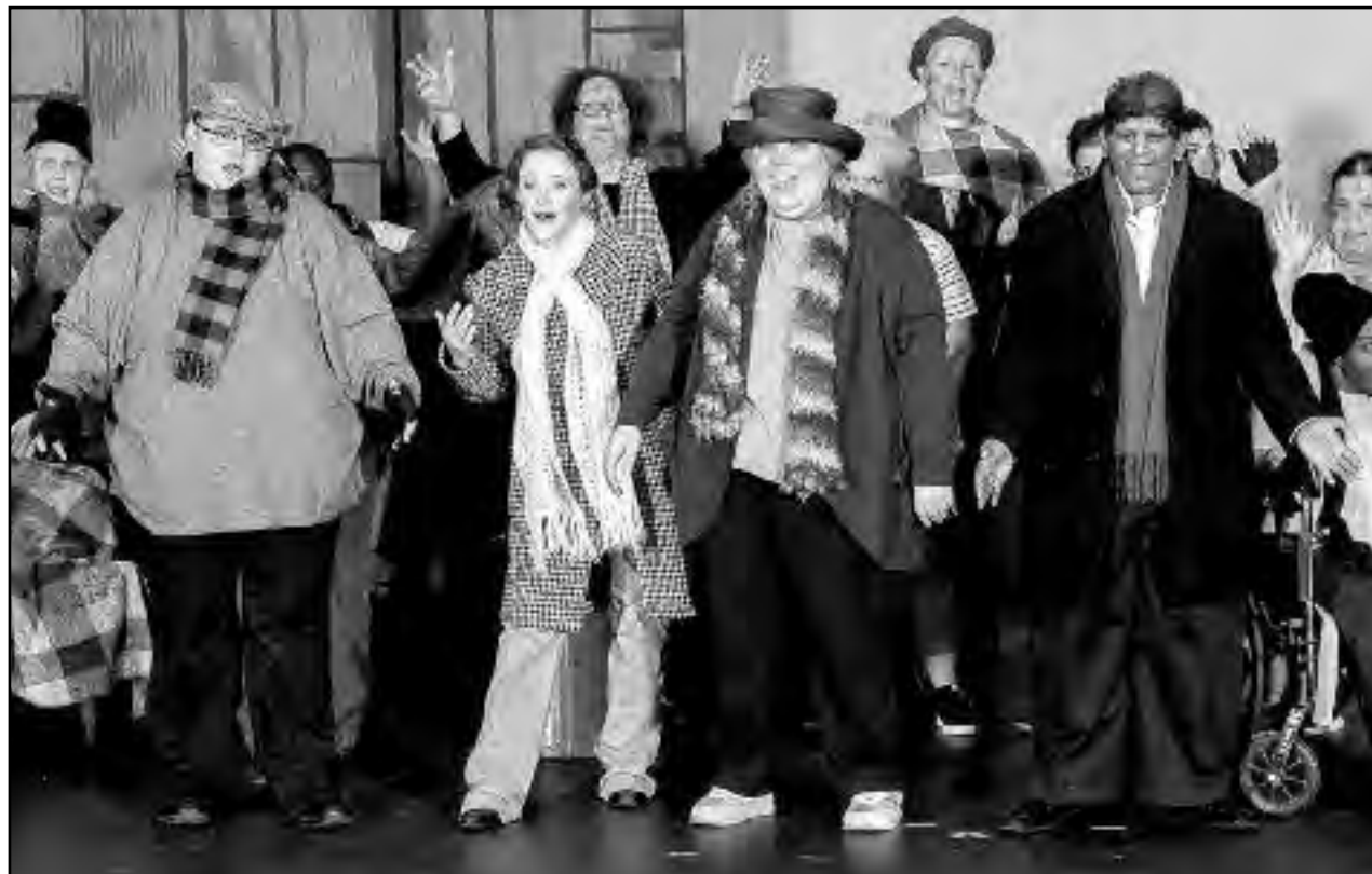
(above) Cast members of "Annie, Jr." during one of last year's performances.

80 West Grant Street, Elizabeth, NJ 07202