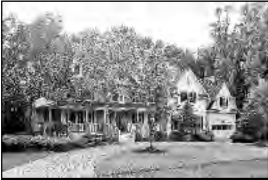
1231 Cooper Road, Scotch Plains Offered at $999,999