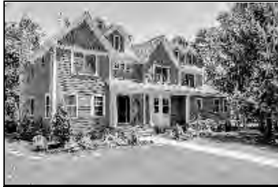
110 Wychwood Road, Westfield Offered at $1,749,900