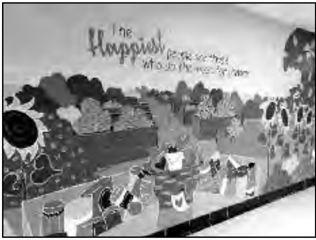
(above) Community service is just one scene depicted as 2nd and 3rd graders at Jefferson Elementary School recently joined parent volunteers in transforming school hallways into a magical scene of the many events that take place each year.