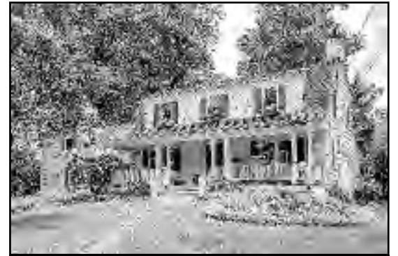
24 Tanglewood Lane, Mountainside Offered at $675,000