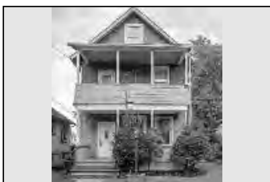
625 Stirling Place, Westfield Offered at $550,000