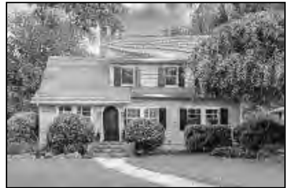
144 Effingham Place, Westfield Offered at $779,000