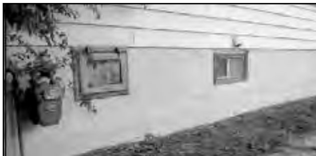
FOUNDATION REPAIRS BEFORE & AFTER