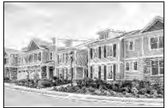
Echo Ridge, Mountainside Offered from $698,000