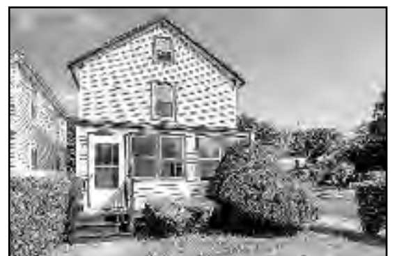
447 Downer Street, Westfield Offered at $375,000