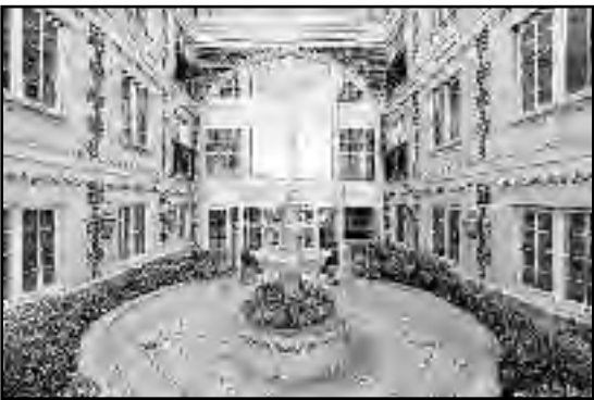
111 Prospect Street 2F, Westfield Offered at $1,299,000