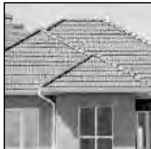
SPANISH STYLE ROOF