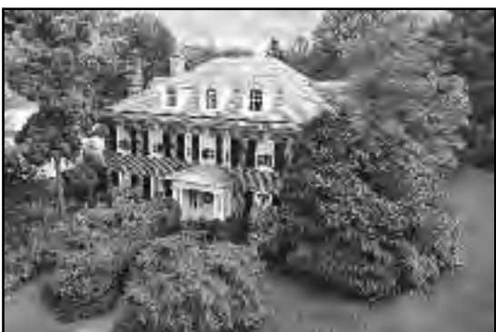
5 Stoneleigh Park, Westfield Offered at $5,000,000