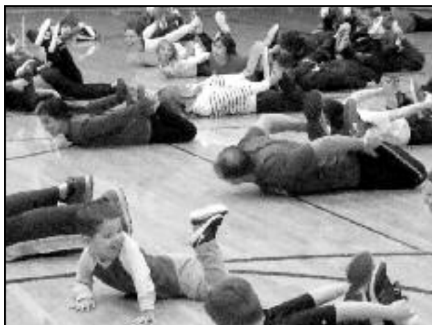
Family Fun Fitness Night at Central School.