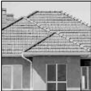
SPANISH STYLE ROOF