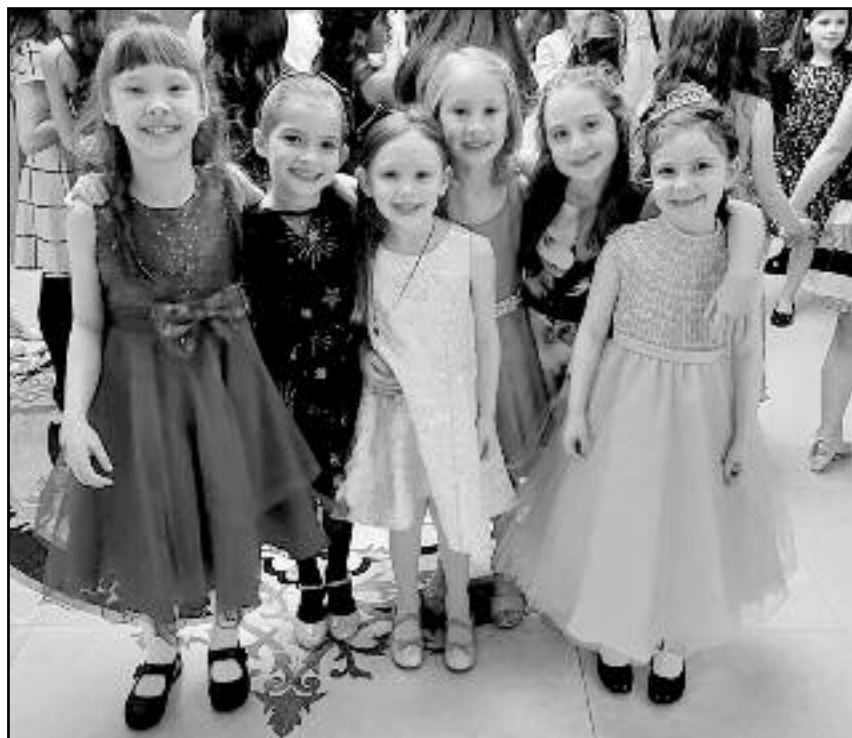
(above) Girl Scout Troop 65278