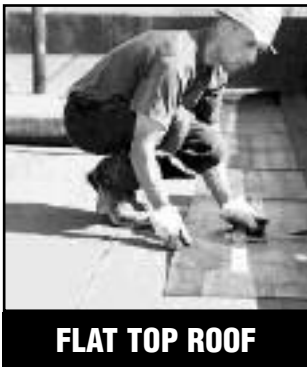
FLAT TOP ROOF