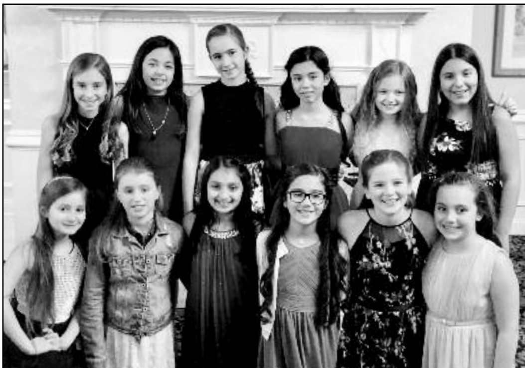
(above) Girl Scout Troop 65025

Girl Scout troops from all over the country host “Me & My Guy” dances to celebrate the special bond between girls and their fathers/significant male mentors. The Warren Girl Scout troops are a part of the Girl Scouts Heart of New Jersey council.