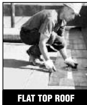
FLAT TOP ROOF