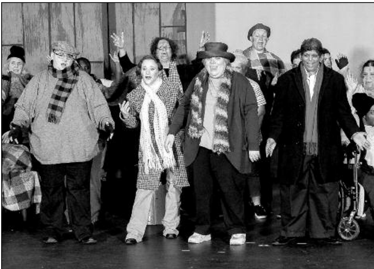
(above) Cast members of "Annie, Jr." during one of last year's performances.

Location: 80 West Grant Street, Elizabeth, NJ 07202