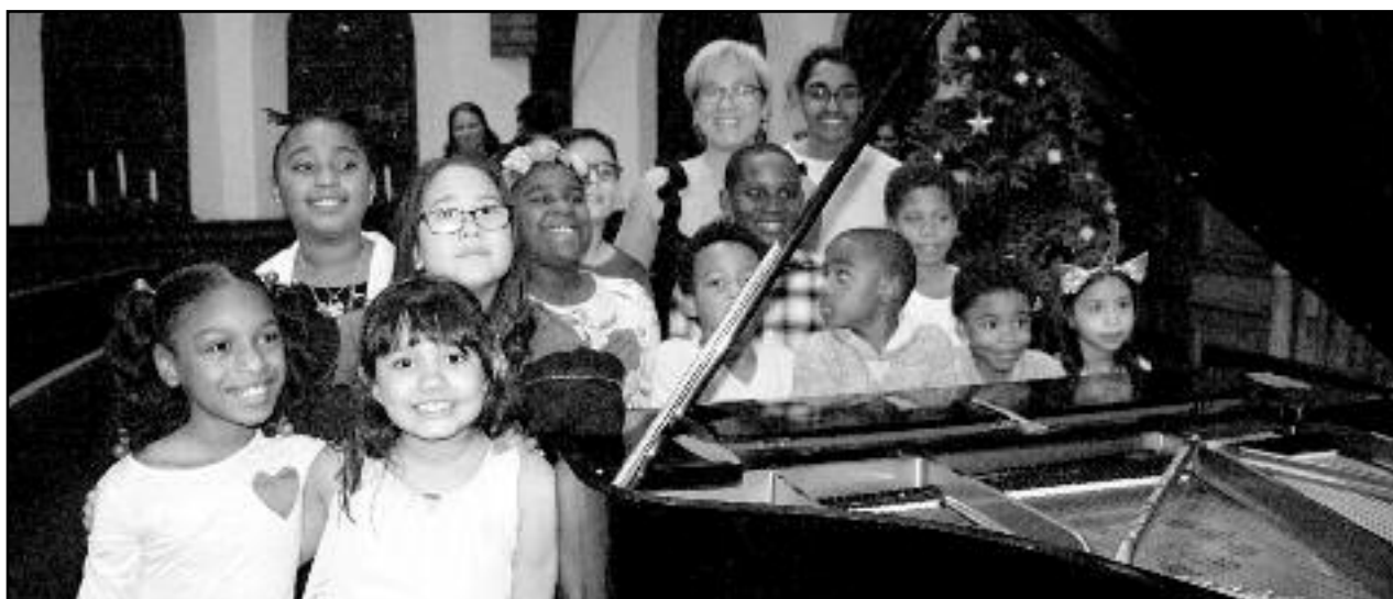
(above) Students from the Keys 2 Success music education program at the benefit concert at Christ Church in Summit.

To learn more about the program, the people, volunteering or donating visit Keys2Success.org online at keysnewark.com .