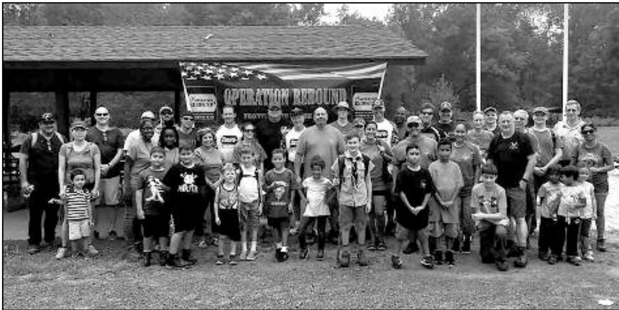
(above) The operation Rebound Racing Team road 25 miles before the Union Memorial Parade and then marched with the veterans.

The team is always looking for members to join and attend our athletic events and hikes. Also, we are in need of athlete mentors and volunteers for our upcoming events. If you want to join or volunteer, please feel free to contact me at Mdbollio@optonline.net or call 973-332-1556. Since all of our money goes to our athletes, we ask anyone willing to donate to please contact us first. This way we can have you donate directly to an athlete or an event. Frontline to finish line!