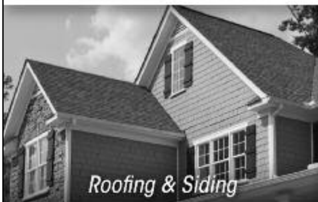
Roofing & Siding