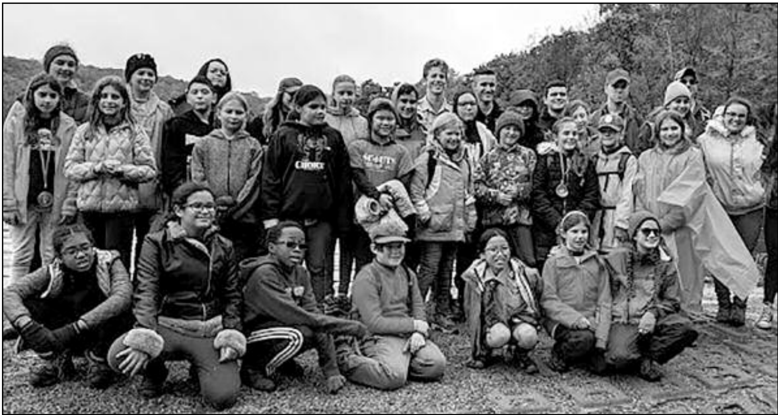
(above) Future Scouts BSA attended a training weekend in October, 2018.

*****ECRWSEDDM***** POSTAL PATRON SUMMIT, NJ 07901