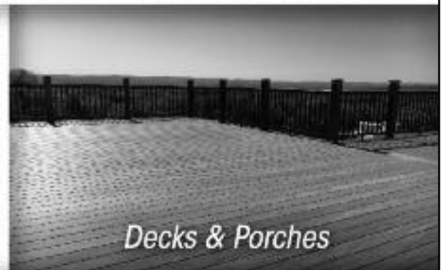
Decks & Porches