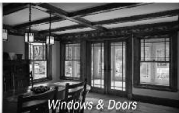
Windows & Doors