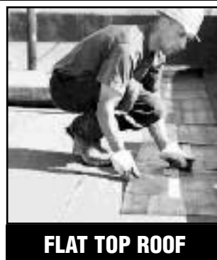
FLAT TOP ROOF