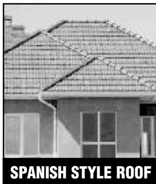
SPANISH STYLE ROOF