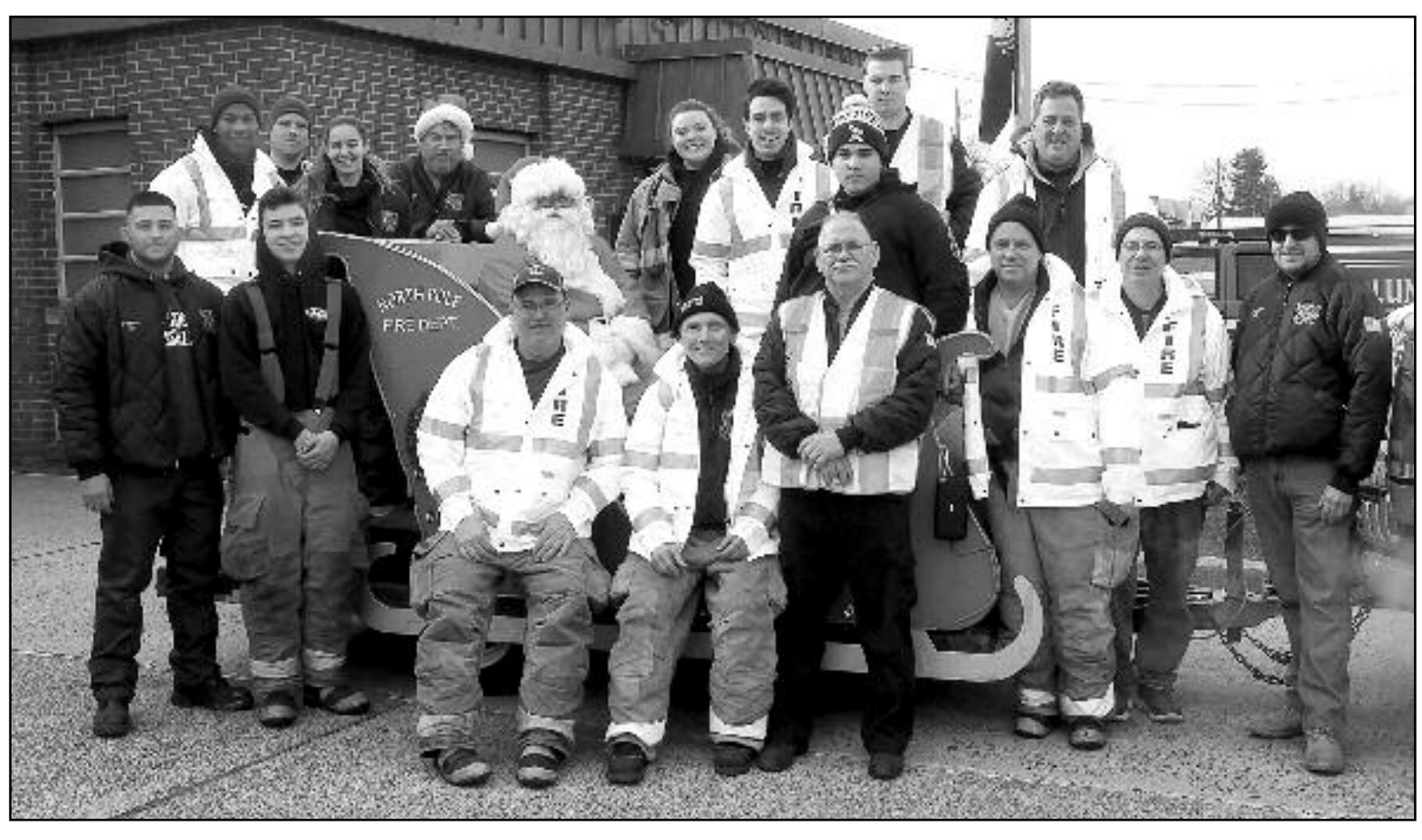
The Garwood Fire Department escorted Santa Claus around the Borough on Sunday, December 9, 2018. Santa stopped to greet residents along the way, and he collected Toys for Tots.