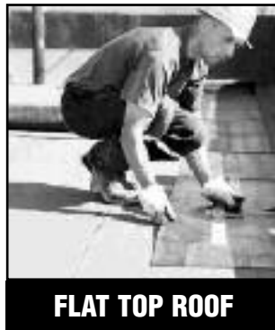
FLAT TOP ROOF