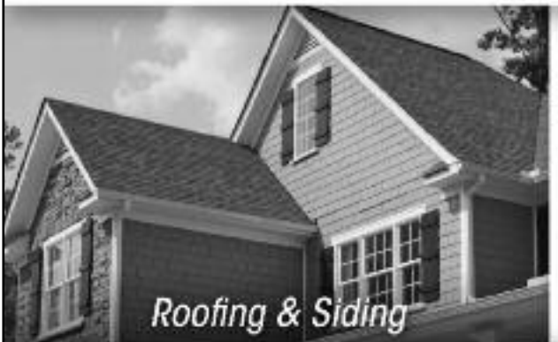
Roofing & Siding