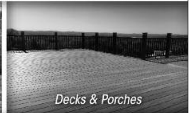
Decks & Porches