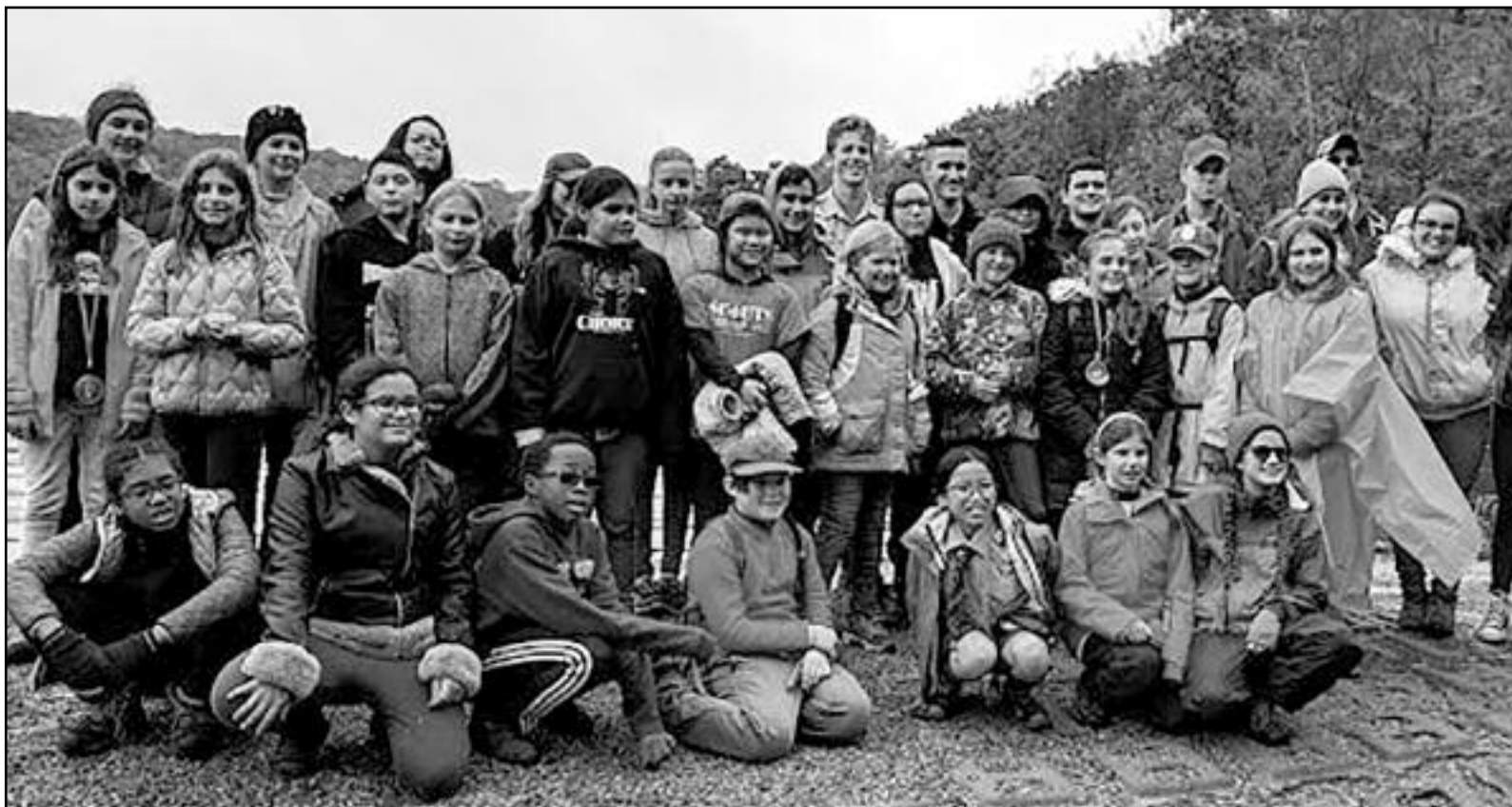
(above) Future Scouts BSA attended a training weekend in October, 2018.

*****ECRWSSDDM***** POSTAL PATRON CHATHAM, NJ 07928