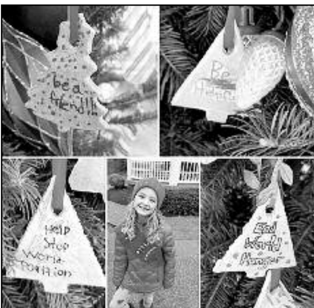
(above) Two of our favorite youth wishes this year were, "Hug more people!" and "Spread joy!" Those participating in the event were asked to bring a small toy to be given to the EMS and Emergency Room staff at Goryeb Children's Hospital where they will be used to comfort kids as they are evaluated for and receive medical treatment. Troop 96054 will deliver the amazing donations (4 very full moving boxes) on behalf of Chatham Girl Scouts.