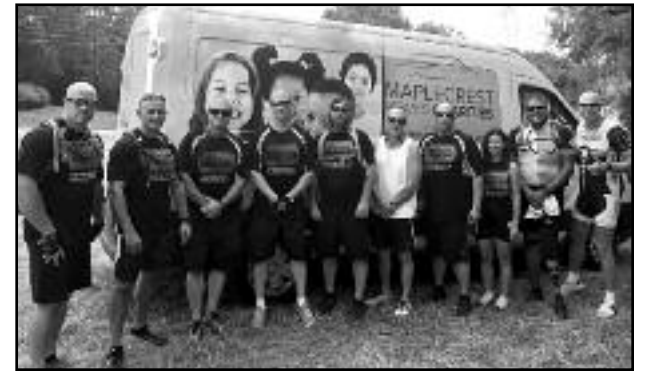
(above) Racing Team's first annual hiking and camping trip at Watchung Reservation.