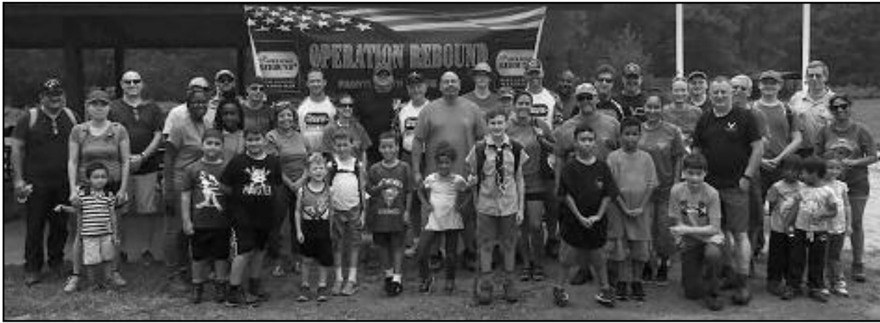
(above) The operation Rebound Racing Team road 25 miles before the Union Memorial Parade and then marched with the veterans.