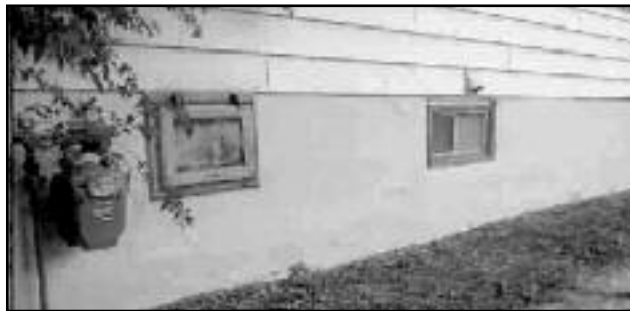
FOUNDATION REPAIRS BEFORE & AFTER