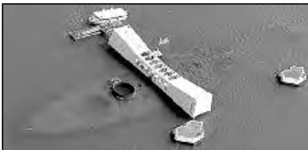
The USS Arizona Memorial, at Pearl Harbor in Honolulu, Hawaii. The bridge straddles, but does not touch the sunken hull, which rests 40 feet below the water surface. It is the final resting place of 1177 U.S. heroes. Each year, 1.8 million visitors pay respect, most in complete silence.