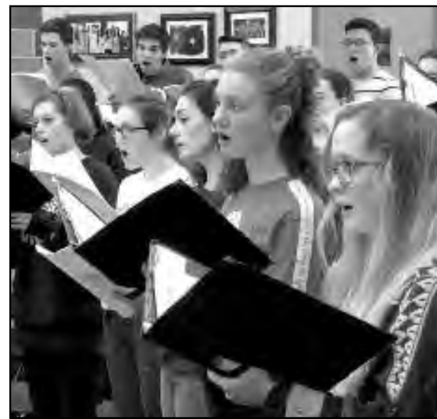
(above) Members of the Cranford High School Concert Choir rehearse for their upcoming Winter Concert on Thursday, December 20.