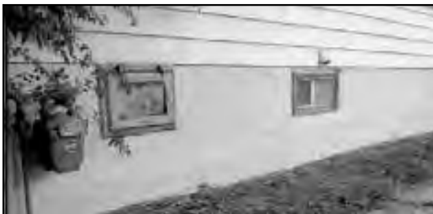
FOUNDATION REPAIRS BEFORE & AFTER