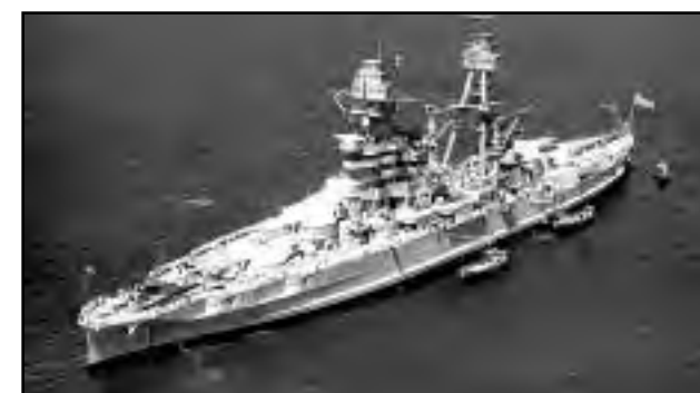
The USS Arizona was 'the biggest and most powerful battleship, both defensively and offensively,' said Franklin D. Roosevelt. Commissioned in 1916, the battleship measured 608 feet in length and 97 feet wide but was never used in WWI due to the oil shortage in Europe. The Pearl Harbor attack was her first and only enemy encounter.

For additional profiles or to purchase volume one of Cranford 86 Hometown heroes booklet, please visit us at Cranford86.org , email us at info@Cranford86.org or call (908) 272-0876.