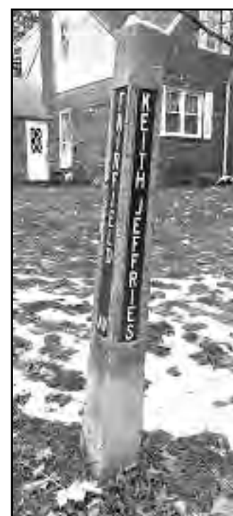
(lef) Keith Jeffries Avenue is among 13 streets named in memory of fallen Cranford service members.