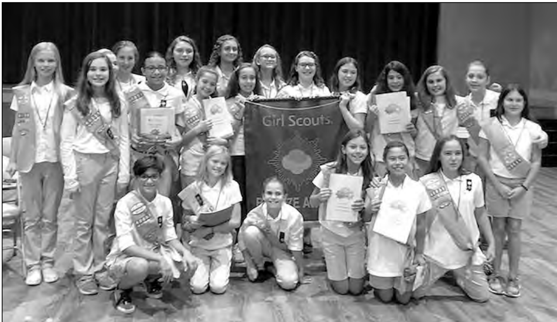
(above) Three Cranford Girl Scout Troops were celebrated at the 2018 Bronze Award Ceremony for their community service projects.

For more information on the Girl Scouts of Cranford, go to cranfordgirlscouts.com .