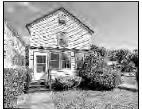
447 Downer Street, Westfield Offered at $375,000