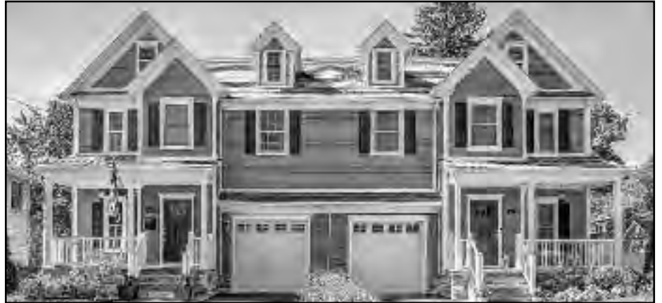
215 Palsted Avenue, Westfield Offered at $638,800