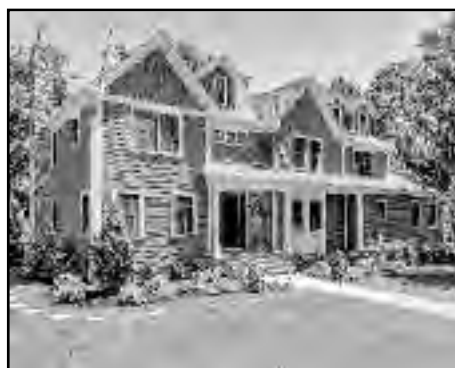
110 Wychwood Road, Westfield Offered at $1,749,900