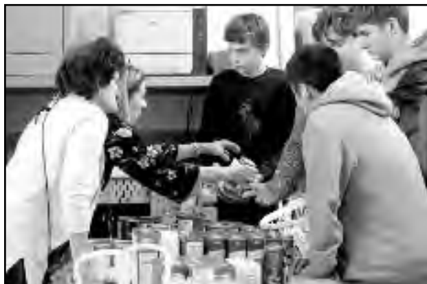
(above) Westfield High School students prepare gift baskets for 4 refugee families who will enjoy a traditional Thanksgiving for the first time.

including St. Joseph's Social Service Center in Elizabeth.