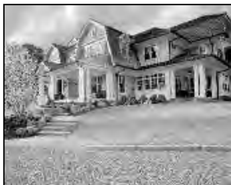
200 Woodland Avenue, Westfield Offered at $4,995,000