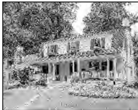
24 Tanglewood Lane, Mountainside Offered at $675,000