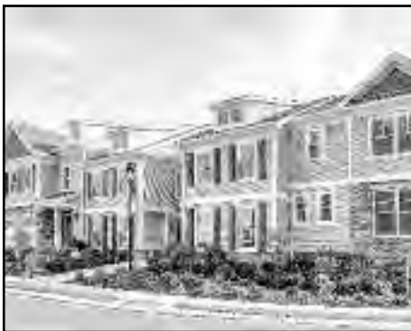
Echo Ridge, Mountainside Offered from $698,000