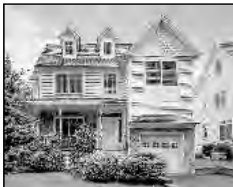
560 Coddling Road, Westfield Offered at $799,900