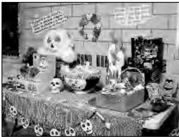
(above) It was a celebration of family and remembrance at Edison Intermediate School on November 2, as students in grades 6-8 and their world language teachers marked Dia de la Muertos, or Day of the Dead, creating a Hallway of Memories with colorful and meaningful displays.

It was a celebration of family and remembrance at Edison Intermediate School on November 2, as students in grades 6-8 and their world language teachers marked Dia de los Muertos, or Day of the Dead, creating a Hallway of Memories with colorful and meaningful displays.