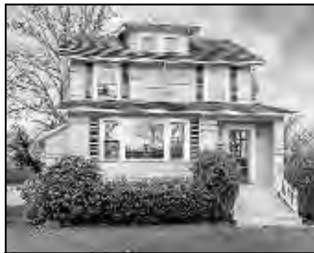
805 Embree Crescent, Westfield Offered at $525,000