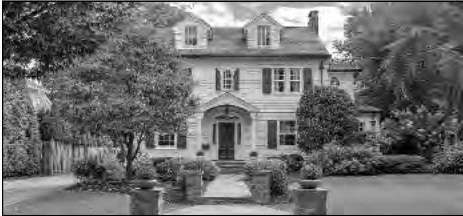
512 Colonial Avenue, Westfield Offered at $1,750,000