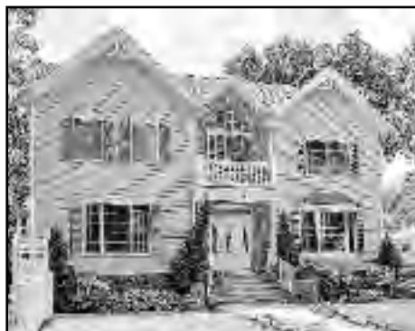
1700 Boulevard, Westfield Offered at $945,000