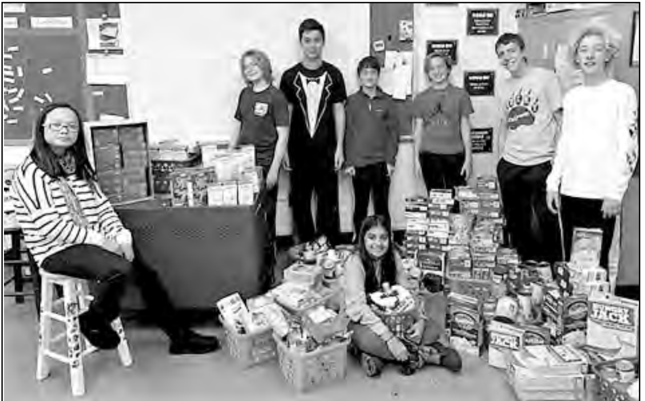
(above) The Edison Student Government Association held a Thanksgiving food drive with 200+ items collected and donated to area food banks and shelters.