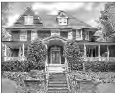
416 Elm Street, Westfield Offered at $1,195,000