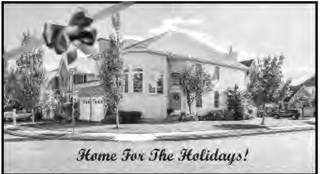
Home For The Holidays!