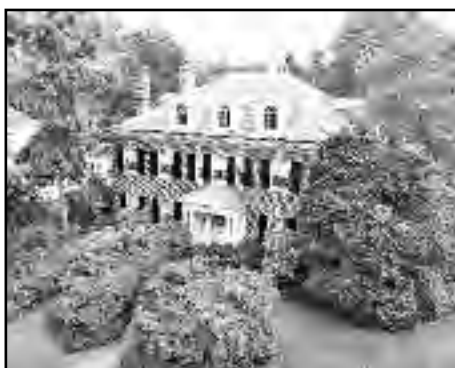
3 Stoneleigh Park, Westfield Offered at $5,000,000