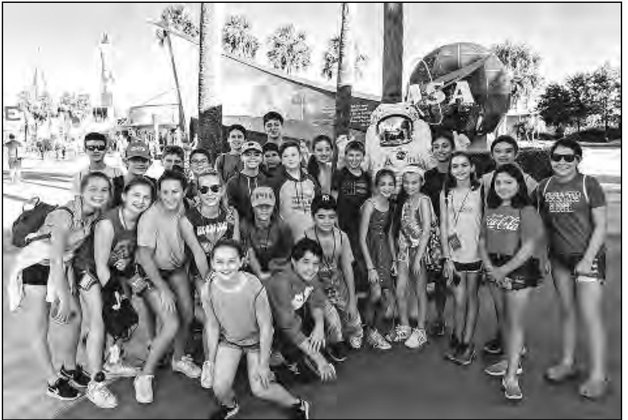
(above) A recent STEM field trip to Florida included a visit to the Kennedy Space Center where 26 seventh graders and four staff members from Edison Intermediate School participated in flight simulators and other programs, visited the rocket garden and launch pads, toured the actual Space Shuttle Atlantis and more.