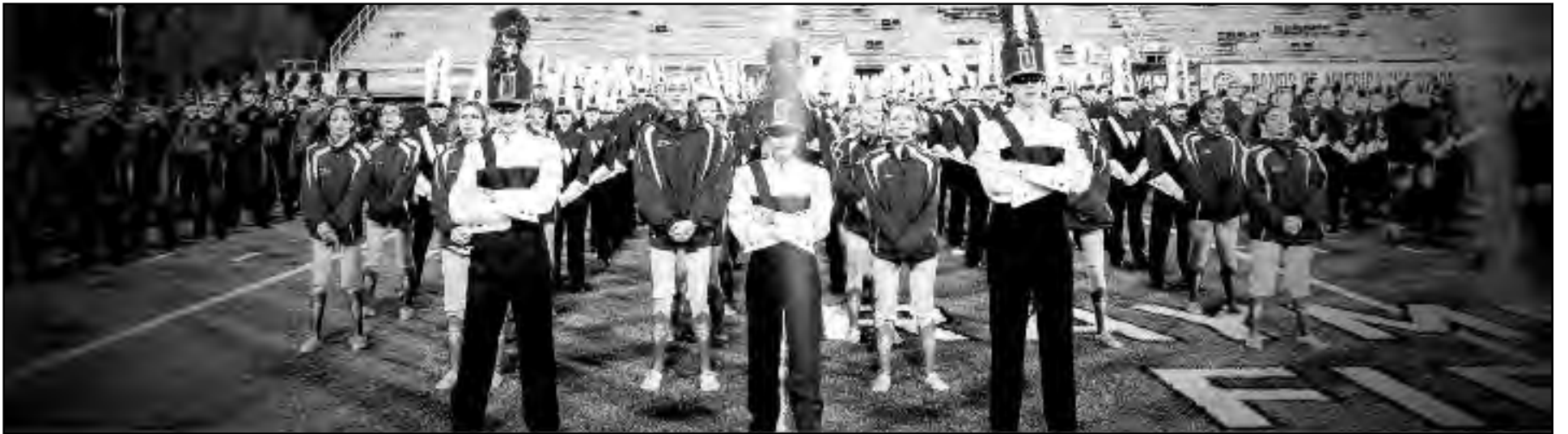
(above) The WHS Marching band was a Mid-Atlantic Regional finalist for the first time ever this year.

The Westfield marching band performed their 2018 production for the final time at the traditional Thanksgiving football game against Plainfield at Plainfield High School.