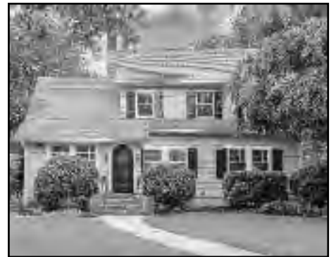
144 Effingham Place, Westfield Offered at $779,000