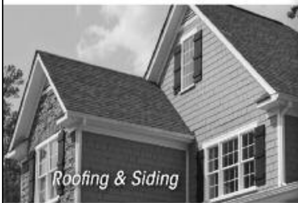
Roofing & Siding