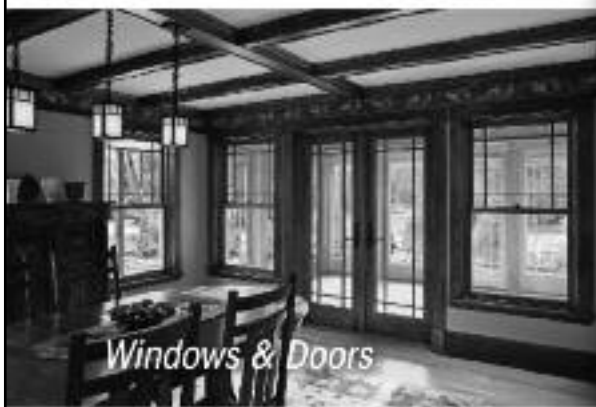
Windows & Doors