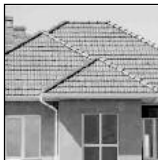
SPANISH STYLE ROOF