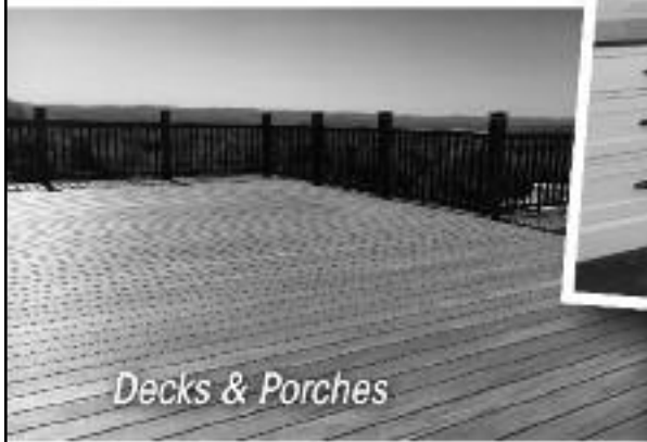
Decks & Porches