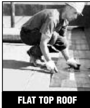
FLAT TOP ROOF