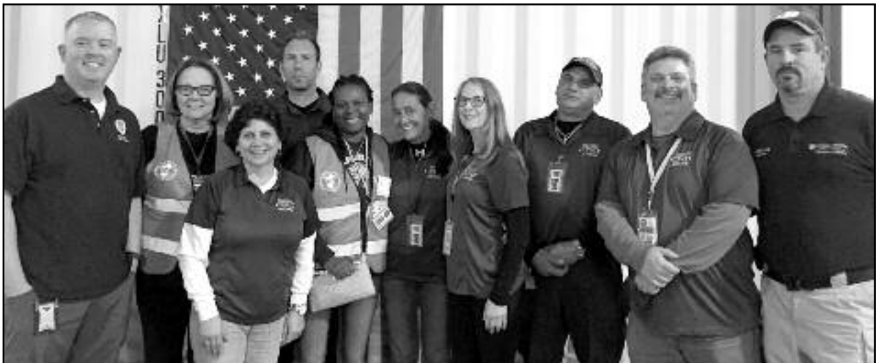
(above) On October 13 and 14, 2018, Green Brook CERT attended the FEMA Region II Community Emergency Response Team Symposium and Full-Scale Exercise. This exercise was an interactive, collaborative team building event planned for two days at the City of Newark Emergency Services Training Center. The team participated in a fictional terrorist attack drill and the resulting aftermath.