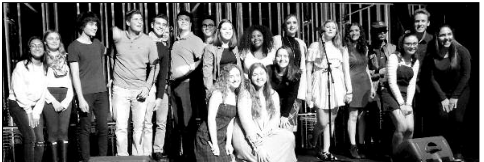
(above) The full cast of the 2018 "Cabaret Night," staged by the WHRHS Script and Cue Student Drama Troupe.