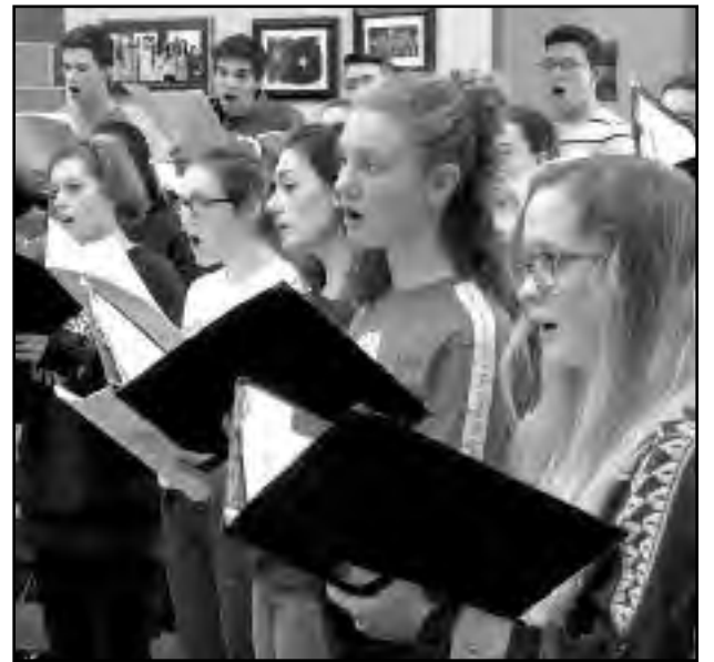
(above) Members of the Cranford High School Concert Choir rehearse for their upcoming Winter Concert on Thursday, December 20.