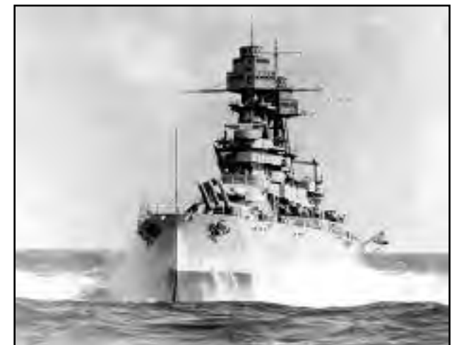
The USS Arizona was equipped with twelve 14-inch guns, capable of hurling half-ton shells over 10 miles.