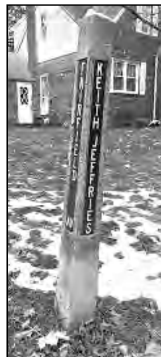
(left) Keith Jeffries Avenue is among 13 streets named in memory of fallen Cranford service members.