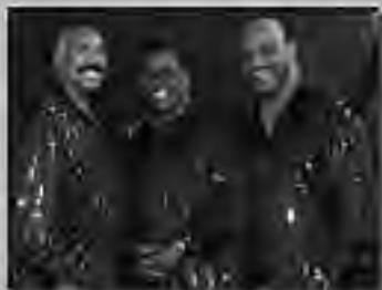
THE ORIGINAL TYMIES