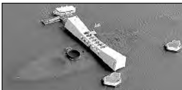
The USS Arizona Memorial, at Pearl Harbor in Honolulu, Hawaii. The bridge straddles, but does not touch the sunken hull, which rests 40 feet below the water surface. It is the final resting place of 1177 U.S. heroes. Each year, 1.8 million visitors pay respect, most in complete silence.