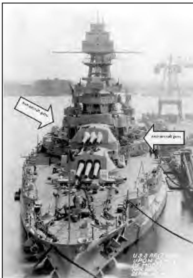
The foredeck of the USS Arizona, where Keith Jeffries was reportedly manning an anti-aircraft gun when he was killed 12/7/1941. The ship sustained a final blow near the big-gun turrets, and likely triggered a destructive explosion below deck in the main ammunition storage room.