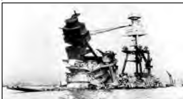
The USS Arizona, following two days of fire caused by the Pearl Harbor attack. The structures above the waterline were eventually removed and either scrapped or reused. The explosion was so strong that it somehow extinguished the fires of the neighboring ships.