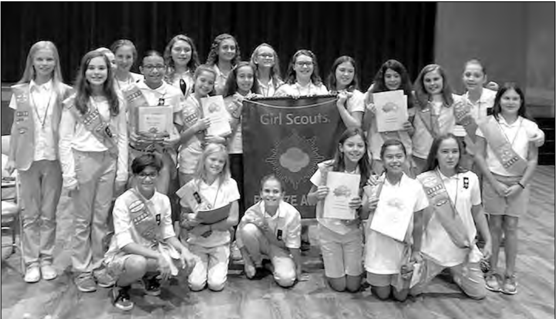
(above) Three Cranford Girl Scout Troops were celebrated at the 2018 Bronze Award Ceremony for their community service projects.

For more information on the Girl Scouts of Cranford, go to cranfordgirlscouts.com .