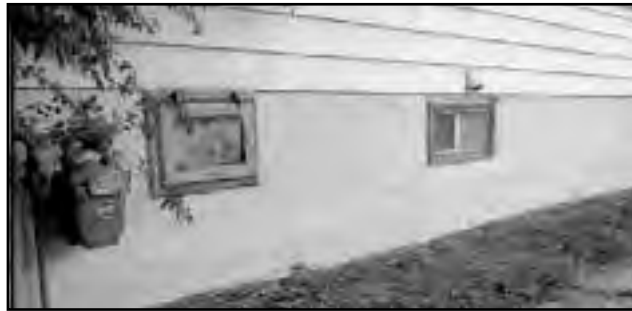
FOUNDATION REPAIRS BEFORE & AFTER