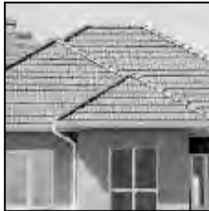
SPANISH STYLE ROOF