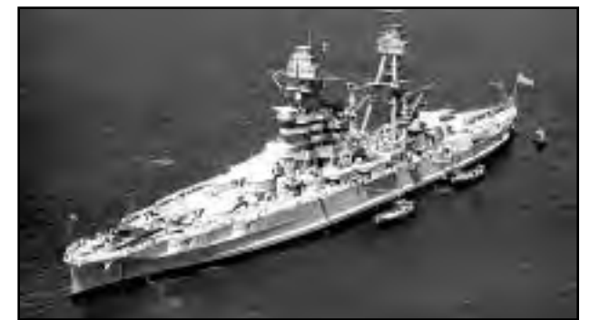
The USS Arizona was 'the biggest and most powerful battleship, both defensively and offensively,' said Franklin D. Roosevelt. Commissioned in 1916, the battleship measured 608 feet in length and 97 feet wide but was never used in WWI due to the oil shortage in Europe. The Pearl Harbor attack was her first and only enemy encounter.

For additional profiles or to purchase volume one of Cranford 86 Hometown heroes booklet, please visit us at Cranford86.org, email us at info@Cranford86.org or call (908) 272-0876.