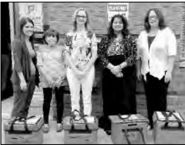
(above) Rotary Club members preparing to deliver Meals on Wheels.