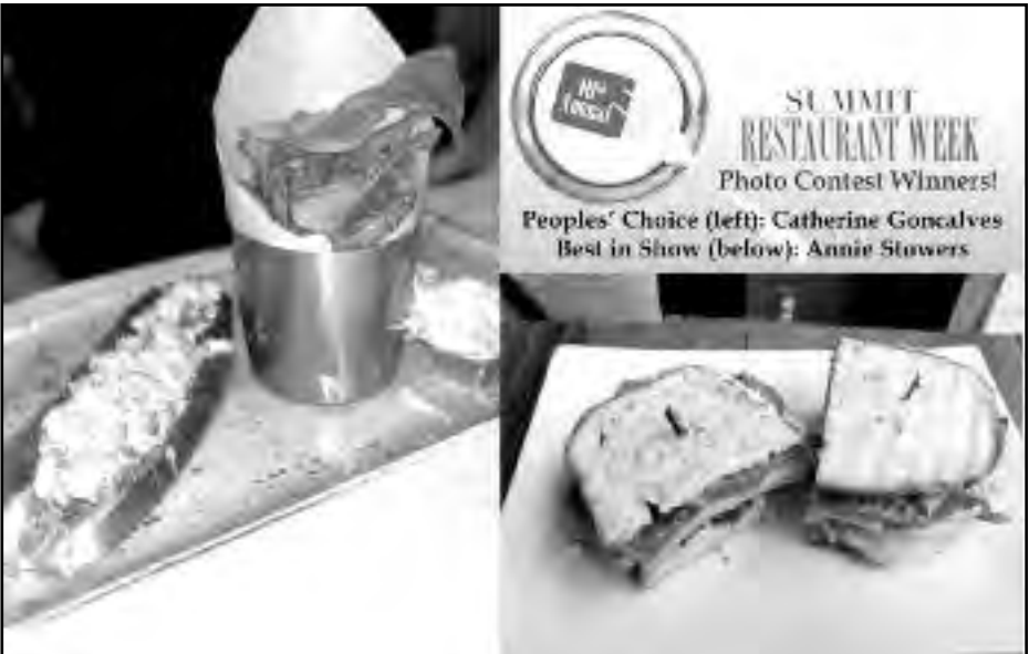
(above) Restaurant Week Photo Contest story on page 2.

The Repair Café concept arose in the Netherlands in 2009, created by Martine Postma, an Amsterdam-based journalist/publicist. In 2010, she started the Repair Café Foundation (see RepairCafe.org ). This foundation provides support to local groups around the world wishing to start their own Repair Café. The foundation supports the Repair Café in Summit.