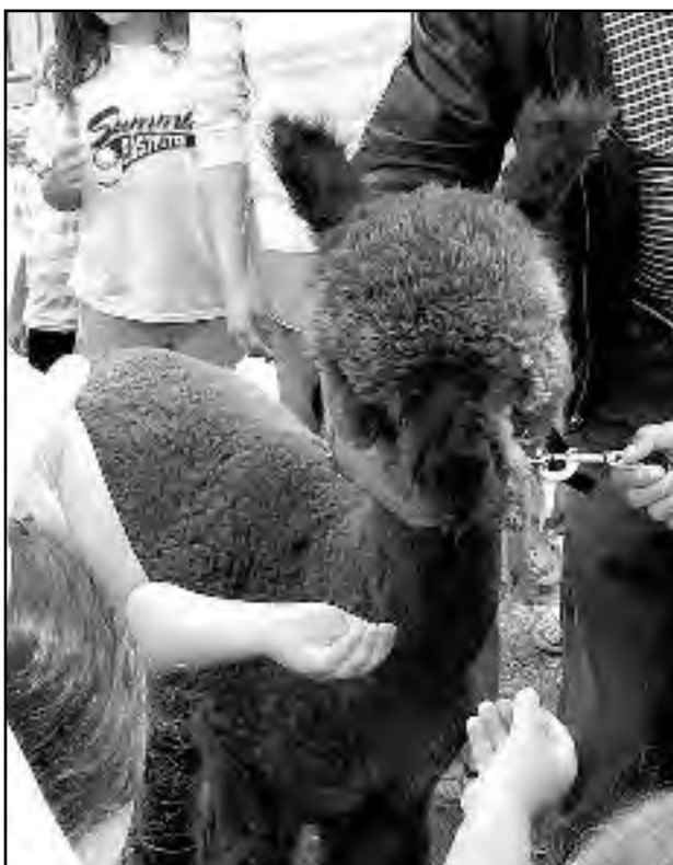
(above) On August 9, 2018 Calum the Alpaca from Highland Airs Alpaca Ranch visited the Summit Free Public Library!

The Summit Free Public Library Foundation invites you to support the Summit Free Public Library while enjoying opening night of Dreamcatcher's newest play, Dead and Buried. Join us for an entertaining evening as we toast this dark comedy. Set in a small New England town at Halloween, 18-year-old Perdue finds a job in the local graveyard. Perdue has come to town to live with her aunt while searching for her missing mother. Wine & cheese reception at 6:30 p.m., followed by performance at 8:00 p.m. $60/pp (part of which is tax-deductible). At the Oakes Center, 120 Morris Ave., Summit. Call 908-273-0350 to order tickets or visit our website for details at www.summitlibrary.org .