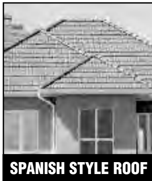
SPANISH STYLE ROOF