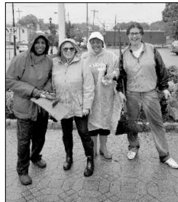
(above) Members of the Union Township Garden Club were joined by helpers from the community to town hall's spring flowers this year.