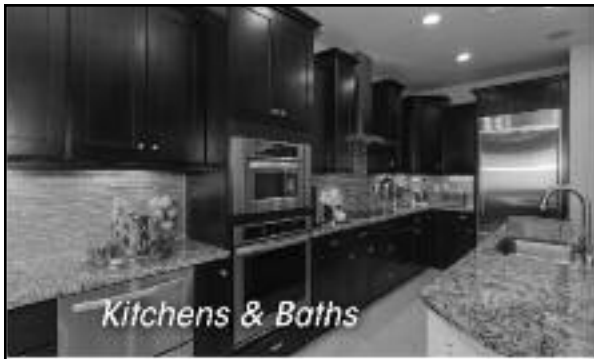
Kitchens & Baths