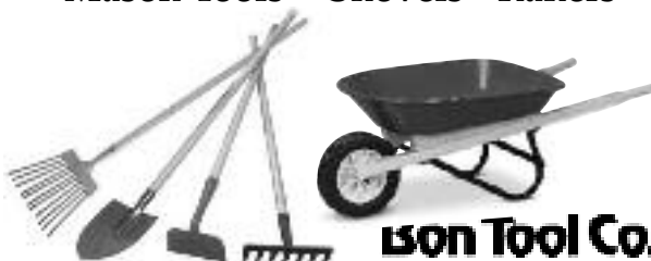
son Tool Co.