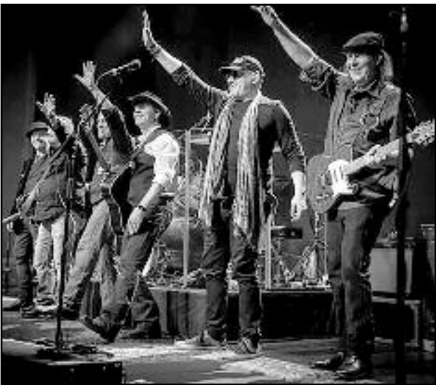
(above) A photo of EagleMania, who will be performing a part of the Township of Union's Summer Concert Series on July 19 at Rabkin Park.

Concerts are sponsored by various community partners. For more information on sponsoring one of our concerts please contact Township of Union Administration at 908-851-8500.