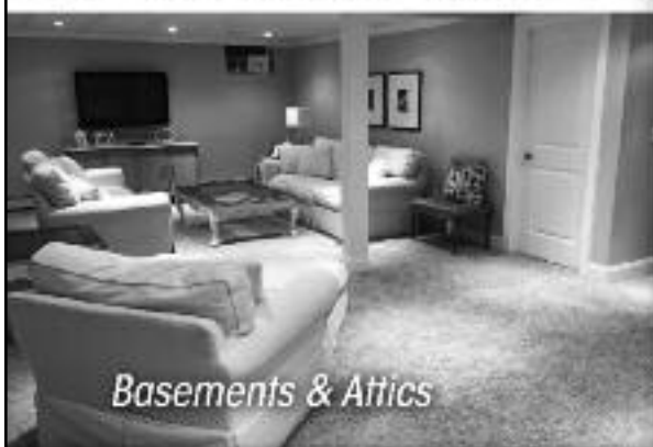
Basements & Attics