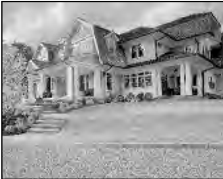
200 Woodland Avenue, Westfield Offered at $6,950,000