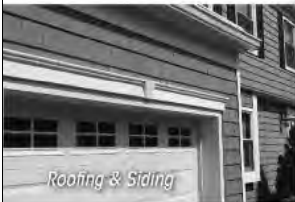
Roofing & Siding