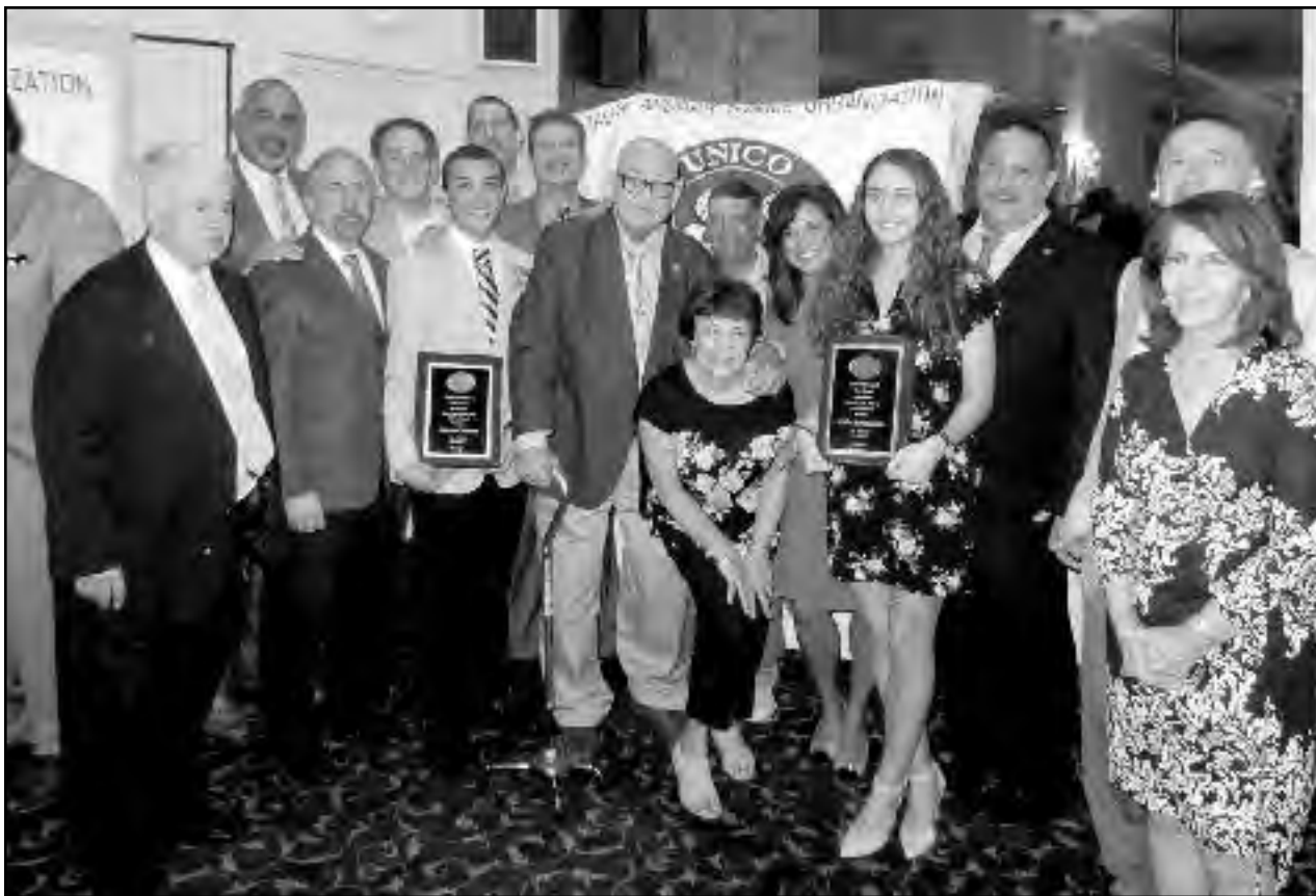
(above) Clark UNICANS with the recipients.