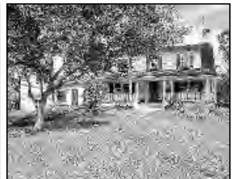
24 Tanglewood Lane, Mountainside Offered at $725,000