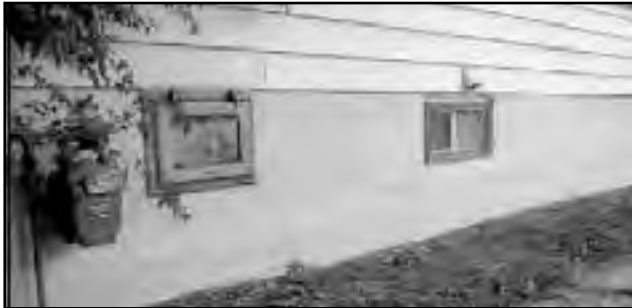
FOUNDATION REPAIRS BEFORE & AFTER