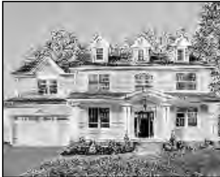
512 Bradford Avenue, Westfield Offered at $1,550,000