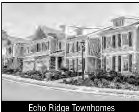
Echo Ridge Townhomes 1350 Route 22 East, Mountainside Offered from the Mid 700's