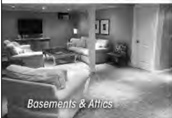
Basements & Attics