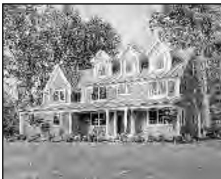
1741 Cooper Road, Scotch Plains Offered at $1,299,000