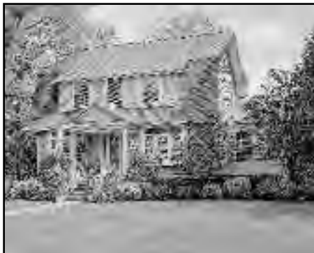
156 N. Martine Avenue, Fanwood Offered at $689,000