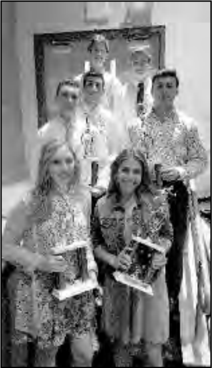
(above, right-left) 2018 Arthur L. Johnson High School Athletic BTAs ans MVPs for the Spring Season.