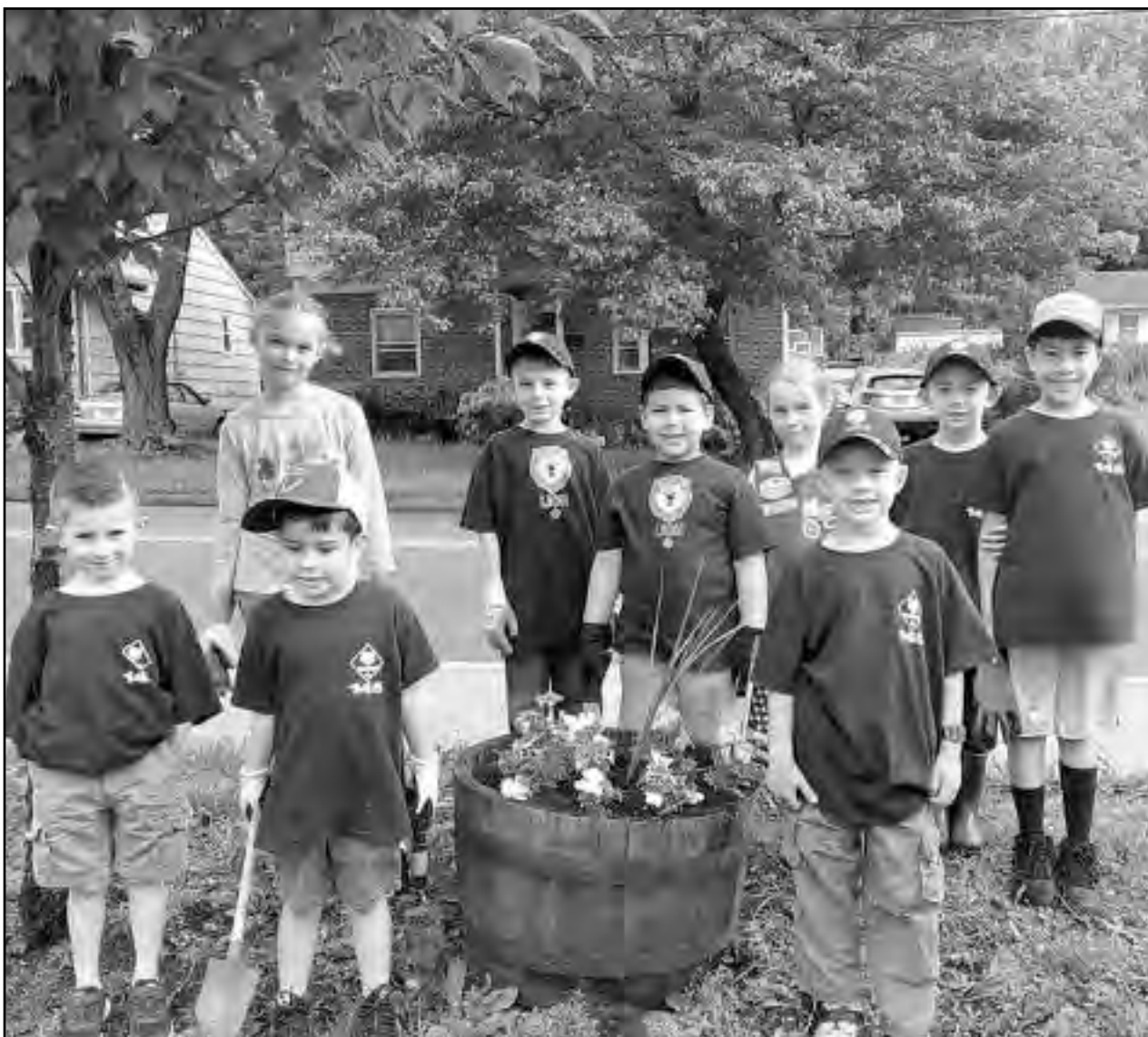
(above) The cub scouts cleaned out the planters and planted beautiful flowers on Westfield Avenue. This is an on-going project to contribute to Clark's beauty. The area by the Parkway Bridge that cub scouts maintains looks awesome.