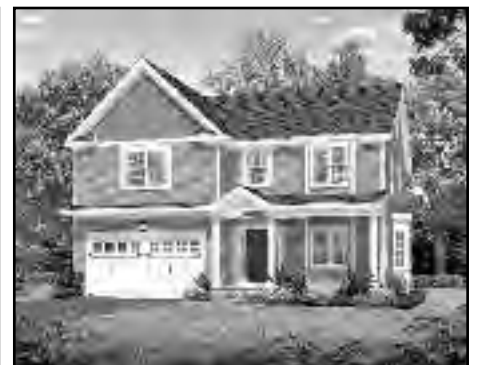
115 Ayliffe Avenue, Westfield Offered at $1,095,000