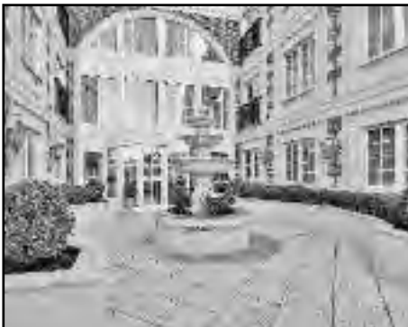
111 Prospect Street 2A, Westfield Offered at $699,900