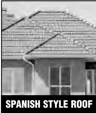
SPANISH STYLE ROOF