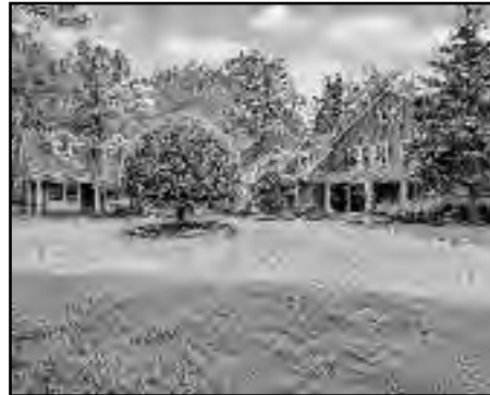
1450 Rahway Road, Scotch Plains Offered at $1,465,000