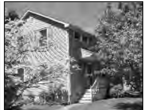
342 Brightwood Avenue, Westfield Offered at $500,000