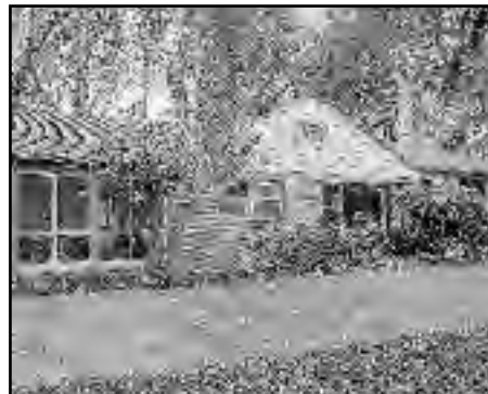
791 Lamberts Mill Road, Westfield Offered at $665,000