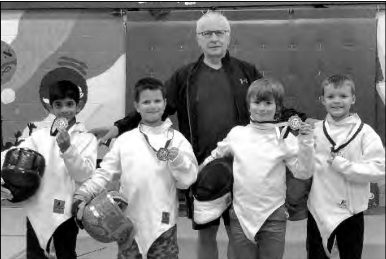
(above) The Clark Recreation Fencing program held this spring taught young fencers the basics of the great sport of fencing thru the Advanced Fencing and Fitness Academy of Garwood.