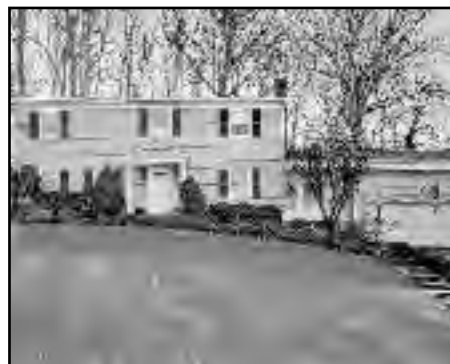
314 Orenda Circle, Westfield Offered at $745,000