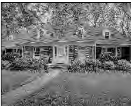
925 Wyandotte Trail, Westfield Offered at $1,350,000