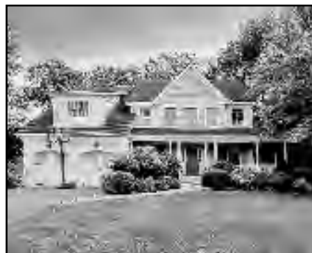
1656 Cooper Road, Scotch Plains Offered at $1,150,000