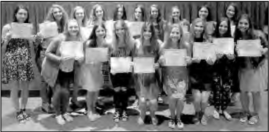
(above) G.P.A. Challenge winners for Girls' Track and Field Team.