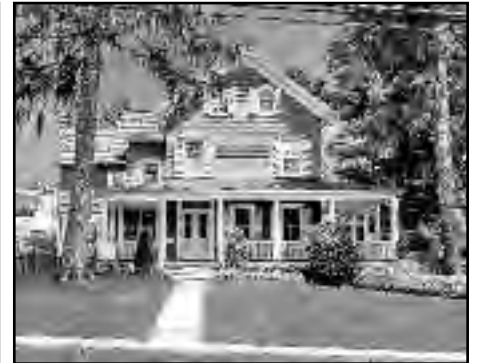
630 Clark Street, Westfield Offered at $1,445,000