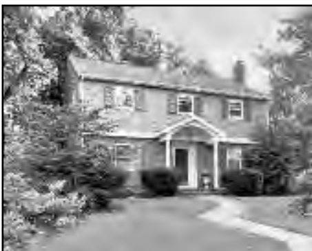
9 Tudor Oval, Westfield Offered at $839,900