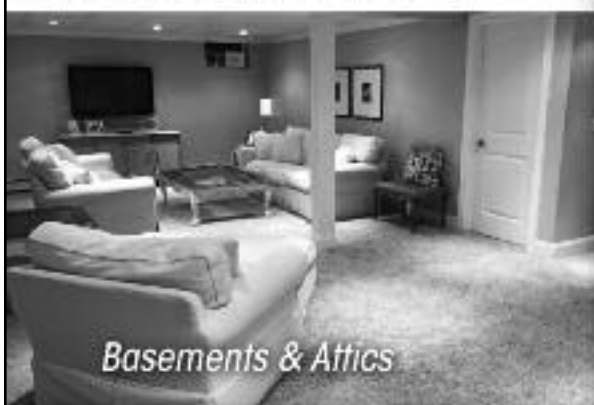
Basements & Attics