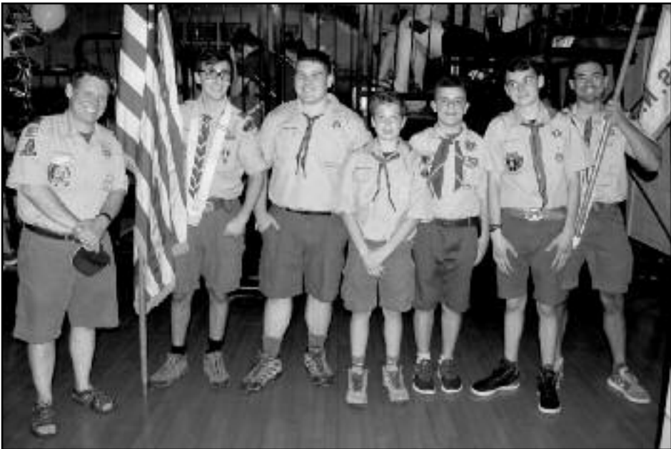
(above) Boy Scout Troup 368 served as Color Guard.