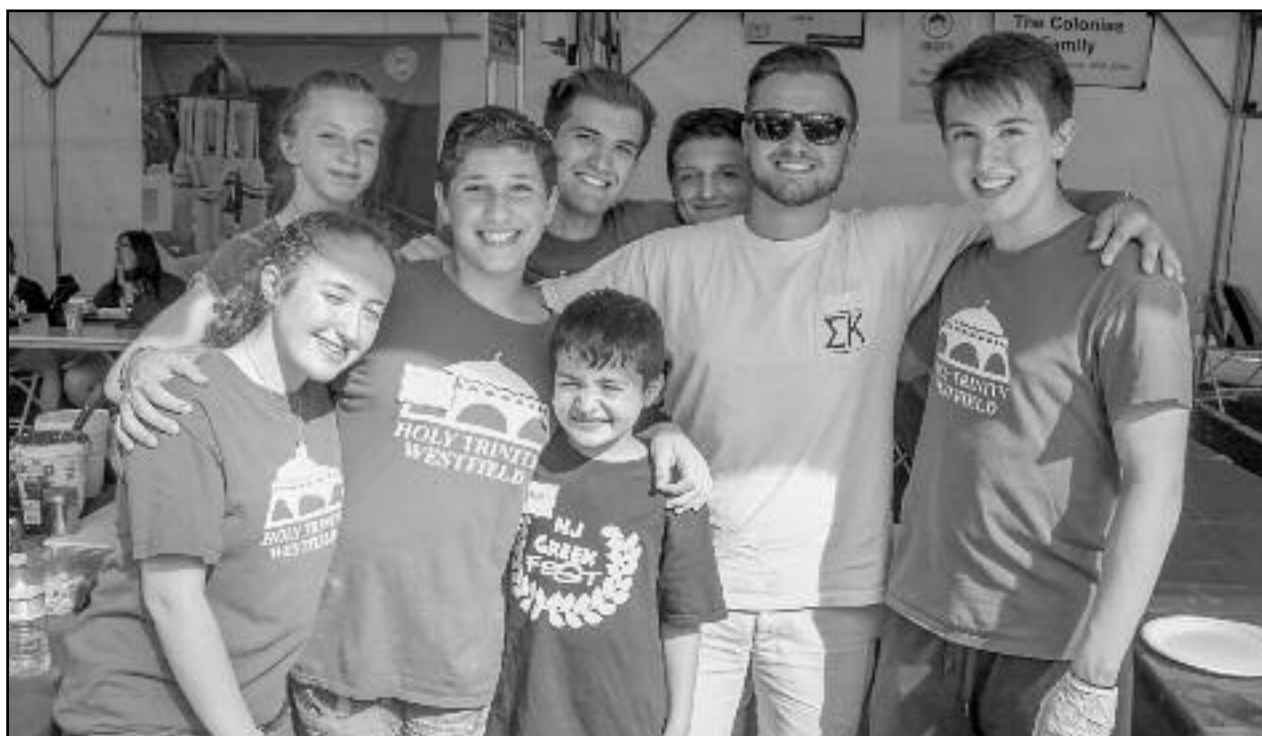
Photos from this and other events can be found online at rennamedia.com and on the Westfield Monthly page on facebook.com .

For more information about Holy Trinity Greek Orthodox Church please visit holytrinitywestfield.org .