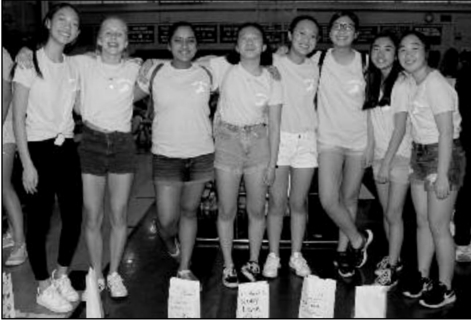
(above) Team 'Soleful' from Berkeley Heights

Photos from this and other events can be found online at rennamedia.com and on the Berkeley Heights News page on facebook.com . Feel free to “Like,” “Tag,” and “Share.”