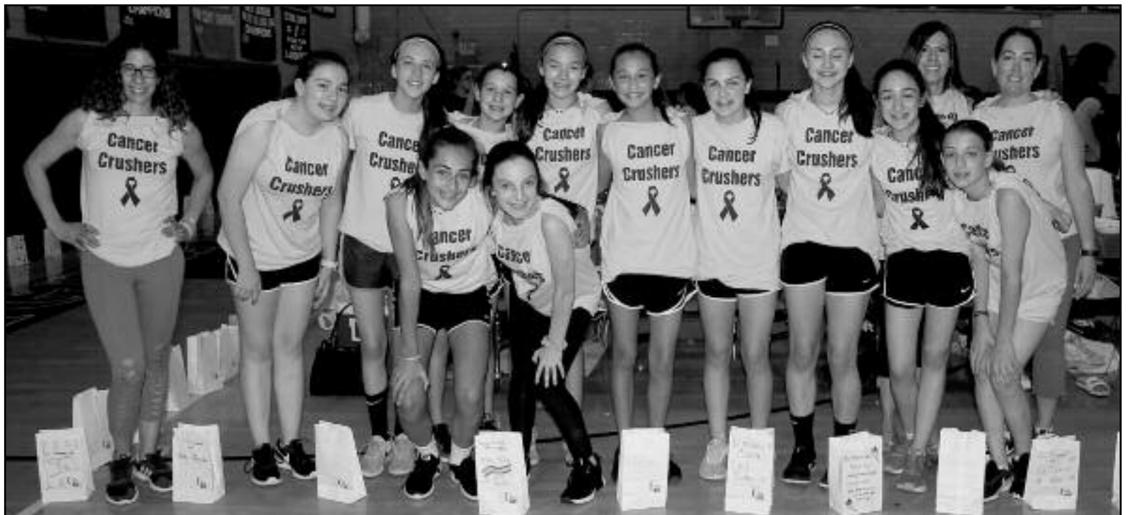
(above) Team 'Cancer Crushers' from Berkeley Heights