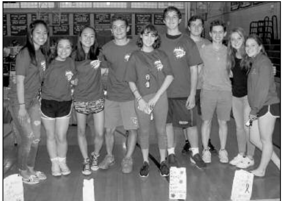
(above) Team 'Wash Out Cancer' from Berkeley Heights & Mountainside