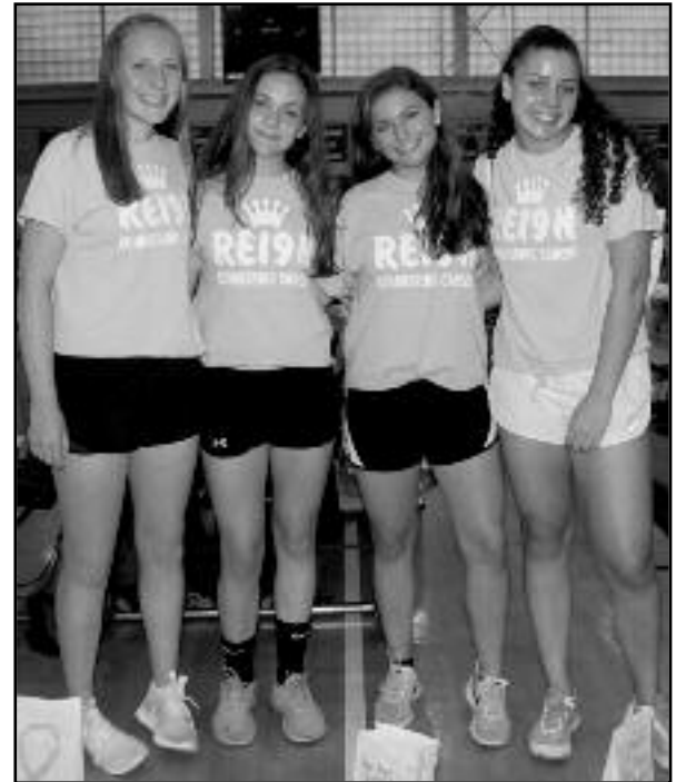
(above) Team 'Rei9n Conquering Cancer' from Berkeley Heights

Photos from this and other events can be found online at rennamedia.com and on the Berkeley Heights Community News page on facebook.com . Feel free to "Like," "Tag," and "Share."