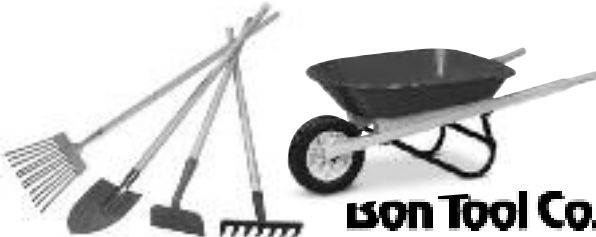
son Tool Co.