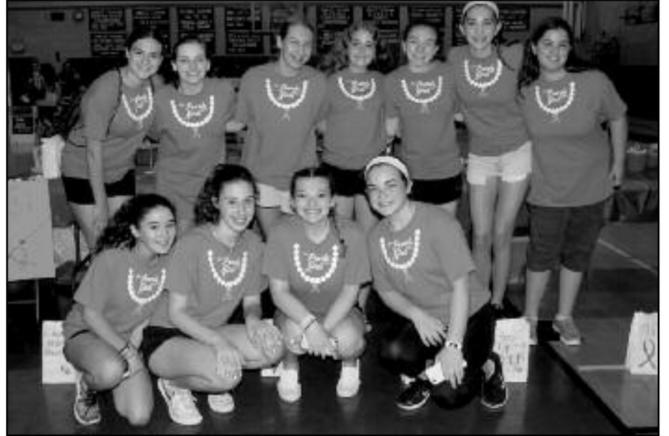
(above) Team 'Pearly Girls' from Berkeley Heights & Mountainside