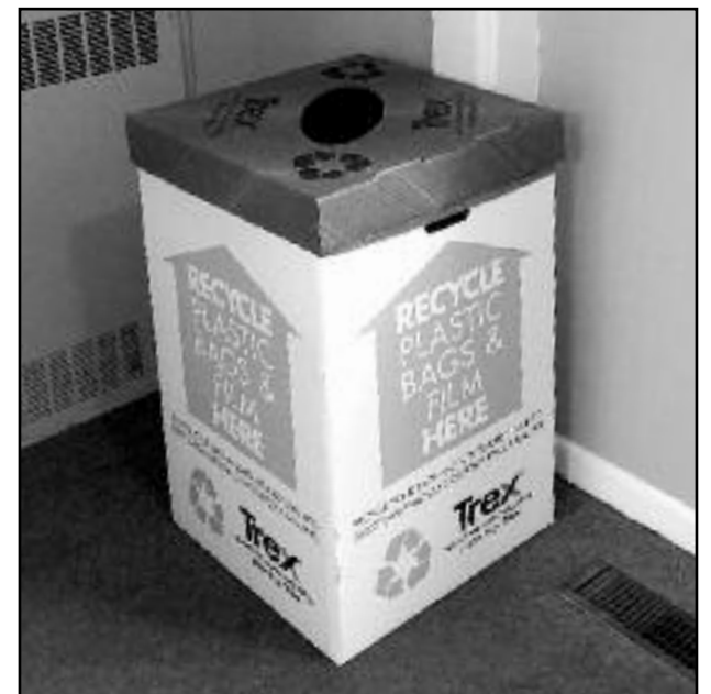
(above) Be on the lookout for Trex Challenge bins around town, where you can deposit your thin film plastics to be made into a park bench.

For additional information about the Trex Challenge, please visit the Berkeley Heights Environmental Commission's Facebook page. or the Trex website at trex.com/recycling/recycling-programs/ .