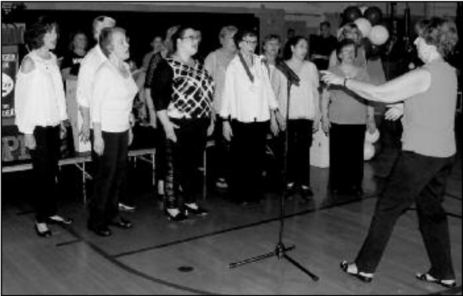
(above) The Hickory Tree Chorus chapter of Sweet Adelines International performed the Beatles tune ‘In My Life.’