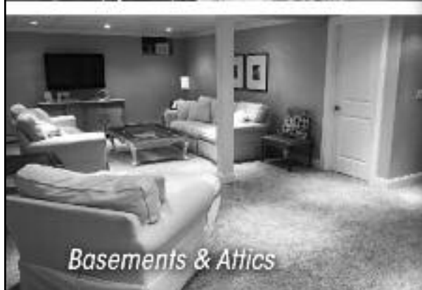
Basements & Attics