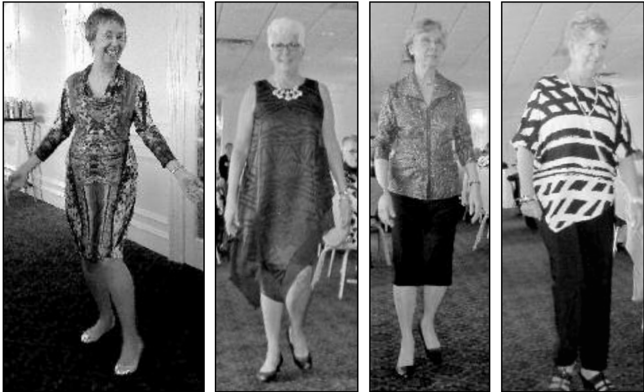
(above) Thursday Morning Club members model outfits from Melania Fashions.

Proceeds from the event benefitted the Madison Community House, which is owned and operated by the Thursday Morning Club, along with its Community House Nursery School and Before and After School Child Care program. Organized in 1896, the club is a member of both the New Jersey State and General Federation of Women's Clubs. For information about the Thursday Morning Club or membership, call the Community House at 973-377-0244 or visit TCMCH.org