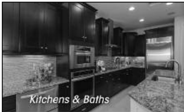
Kitchens & Baths