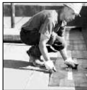
FLAT TOP ROOF