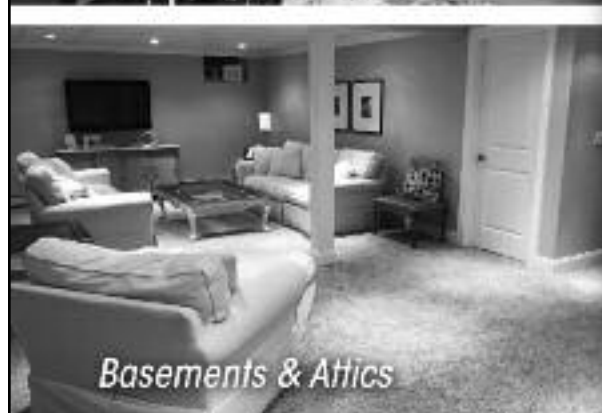
Basements & Attics