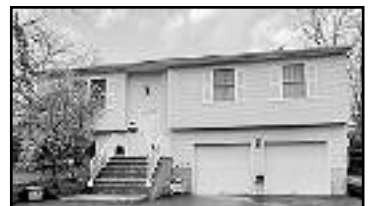
461 Terrill Road