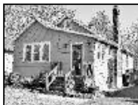
24 Stewart Place