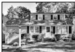
525 Henry Street