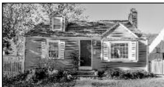
2209 Mountain Ave. Scotch Plains - $379,900