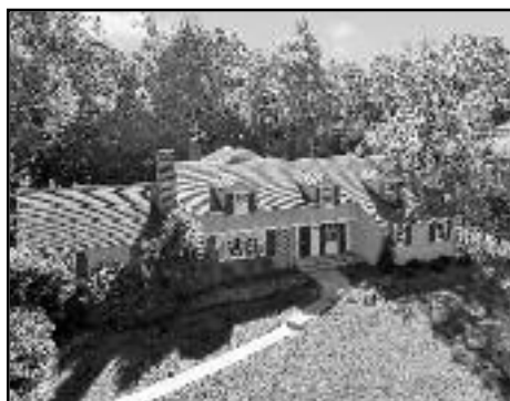
281 Hartshorn Dr, Millburn Offered at $1,585,000