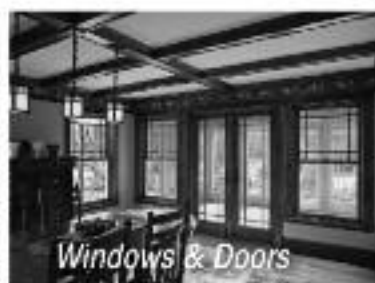
Windows & Doors