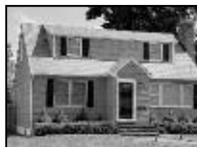
409 Willow Avenue