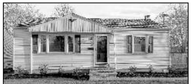
1956 Church Avenue, Scotch Plains - $379,900