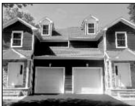
109 Palsted Ave, Unit 1, Westfield Offered at $599,900