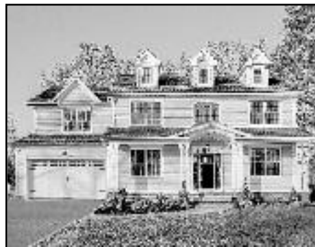
512 Bradford Ave, Westfield Offered at $1,625,000