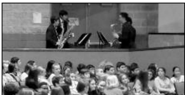
(above) During a break in the main performance space, which gave production crews an opportunity to rearrange chairs and music stands for instrumental bands, a smaller musical group of student musicians, The Sax Quartet, occupied the interest of the audience by performing several jazzy numbers. Among them was, appropriately, "Take Five," Dave Brubeck's best-known composition.