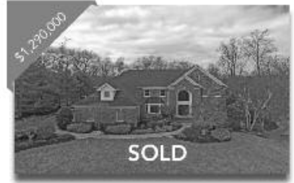
7 Strawberry Lane 5 Bedrooms, 4.2 Baths Beautiful Home in Desirable Neighborhood. Gourmet Kitchen and Expansive Lower Level. 7Strawberry.com