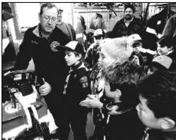
(above) Hands on learning.

PRSR STD U.S. POSTAGE PAID PHILA PA 191 PERMIT NO.7575