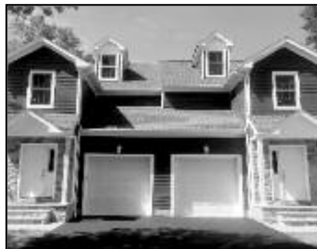
109 Palsted Ave, Unit 1, Westfield Offered at $599,900