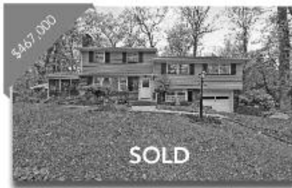
63 Morning Glory Road 5 Bedrooms, 1.2 Baths Private Location with Screened-In Porch, Hardwood Floors and Finished Basement. 63MorningGlory.com