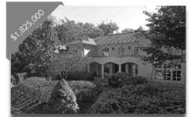
21 Stoningham Drive 6 Bedrooms, 4.2 Baths Beautiful custom designed home with private backyard oasis. Fabulous home. 21Stoningham.com