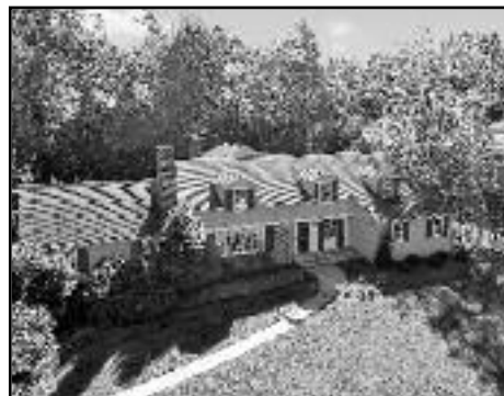
281 Hartshorn Dr, Millburn Offered at $1,585,000