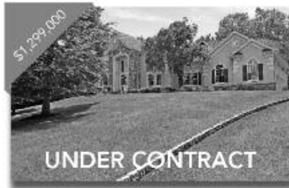
4 Raspberry Trail 5 Bedrooms, 4.1 Baths Beautiful Brookside Manor Colonial With Amazing Private Backyard Oasis. 4Raspberry.com