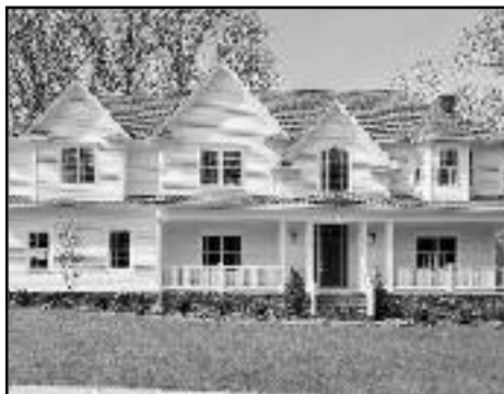
225 Golf Edge, Westfield Offered at $1,799,000