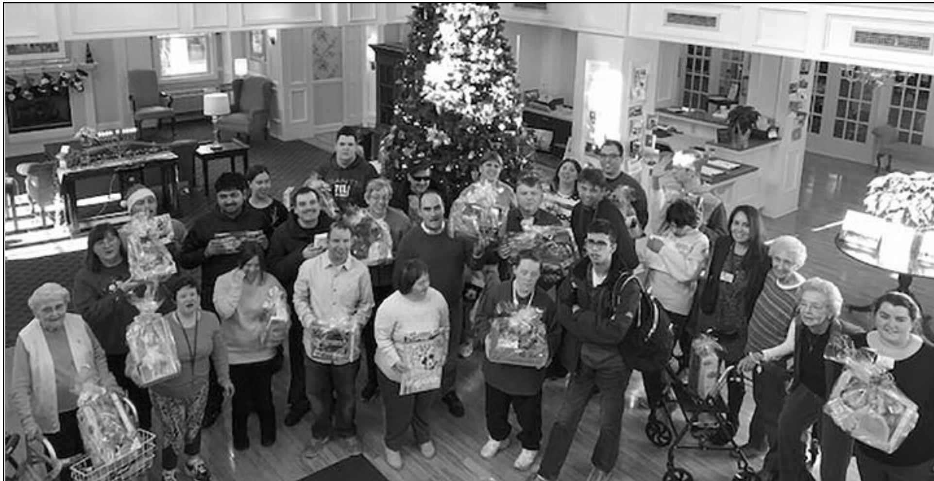
(above) Group photo taken in the lobby of the Chelsea featuring Chelsea and MBV residents, staff and families.

The event was held at Chelsea on December 21st and the toys were distributed by individuals from MBV on December 22nd. Staff, families and seniors from both facilities approached this worthwhile cause with the spirit of giving that defines the Holiday season. Everyone hopes that this becomes a joint effort for years to come!