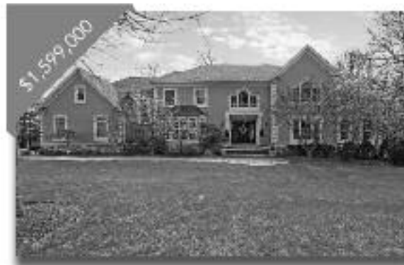
4 Cotswold Lane 7 Bedrooms, 5.1 Baths Elegant Colonial Home Situated on a Quiet Cul-de-Sac With Enormous Curb Appeal. 4Cotswold.com