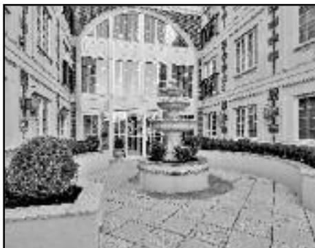
111 Prospect St, Unit 2A, Westfield Offered at $749,000