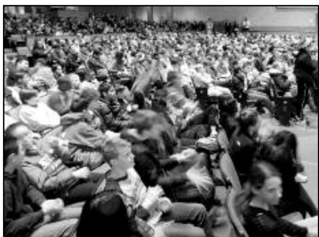
(above) Eighth grade students from Middle School in Warren Township, Long Hill Township, Watchung, and Green Brook Township, all soon-to-be First Year high school students, were the guests of honor at the 2017 Middle School Choral & Instrumental Concert, December 22, 2017, at the WHRHS Performing Arts Center (PAC).