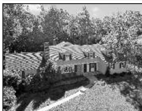
281 Hartshorn Dr, Millburn Offered at $1,585,000