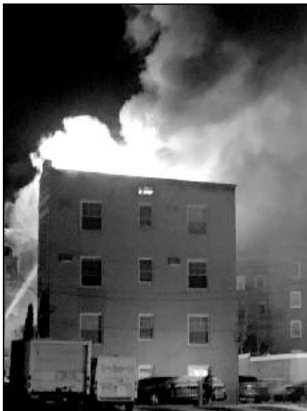
(above) 125 Summit Ave burning at 6:08 a.m.