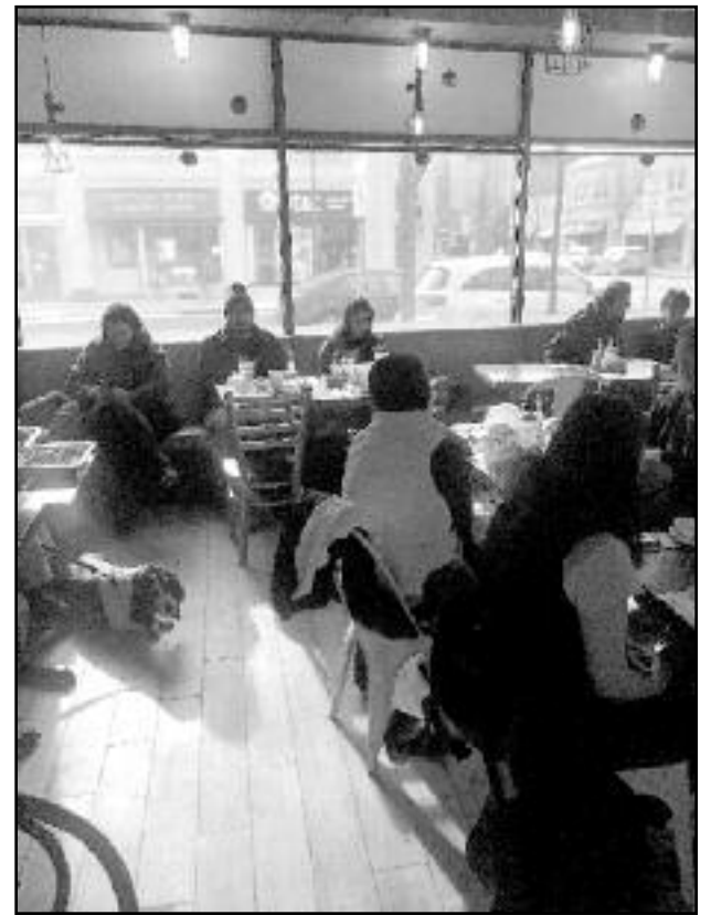
(above) People affected by the fire finding shelter at Committed Pig.

At the time this article was written, the cause of fire was still under investigation.