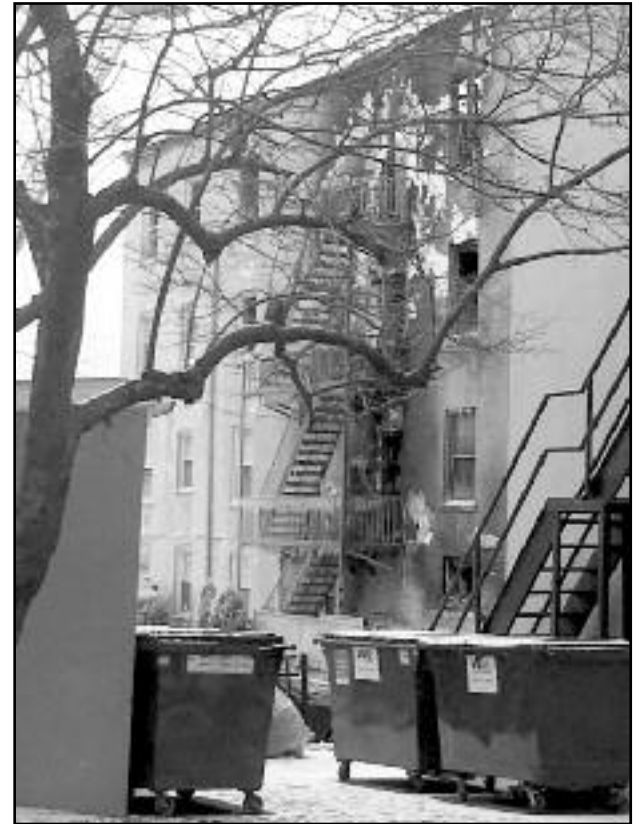
(above) Picture of the rear of 125 Summit Ave. later on that day.