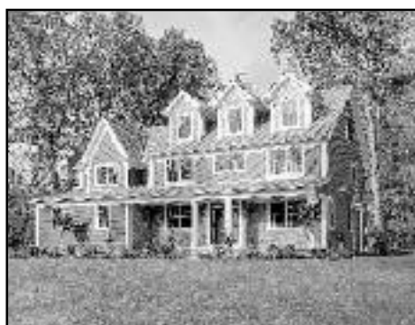
1741 Cooper Rd, Scotch Plains Offered at $1,379,000