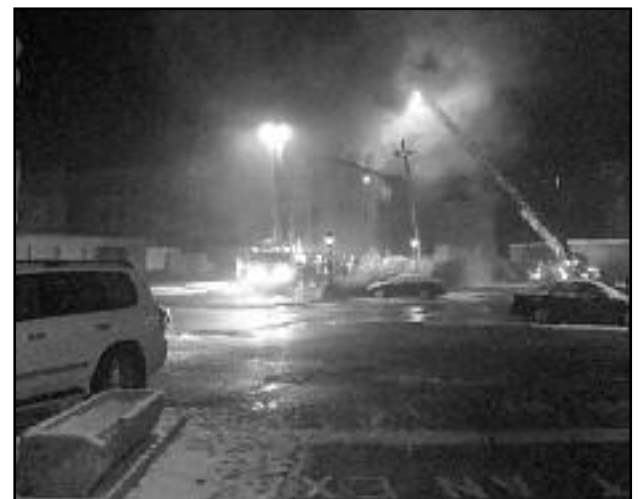
(above) Firefighters working on the fire.