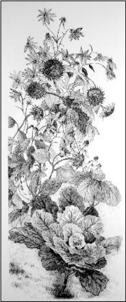
(above) Beauty of Autumn.

Cosmic Garen Series opens at the Wisner House Gallery on Sunday, February 11, 2018, with an artist reception from 2 to 4 p.m., and will run through May 13. All the works are for sale, and the artists will donate 30 percent of all purchases to Reeves-Reed Arboretum.