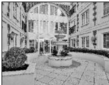
111 Prospect St, Unit 2A, Westfield Offered at $749,000