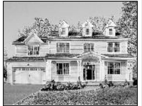
512 Bradford Ave, Westfield Offered at $1,625,000