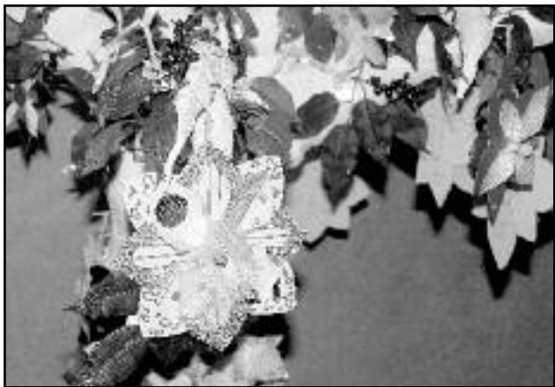
(above) Handcrafted ornament of Hope.