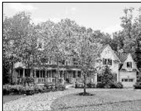
1231 Cooper Rd, Scotch Plains Offered at $1,450,000