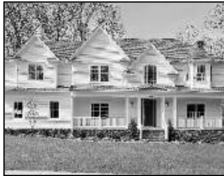
225 Golf Edge, Westfield Offered at $1,799,000