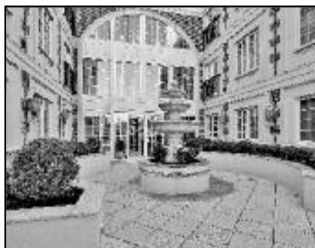
111 Prospect St, Unit 2A, Westfield Offered at $749,000