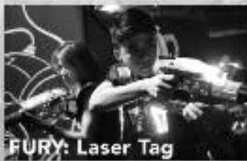
FURY: Laser Tag