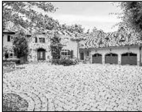
1235 Cooper Rd, Scotch Plains Offered at $1,749,900