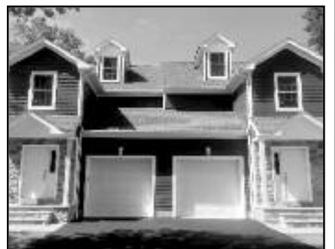
109 Palsted Ave, Unit 1, Westfield Offered at $599,900