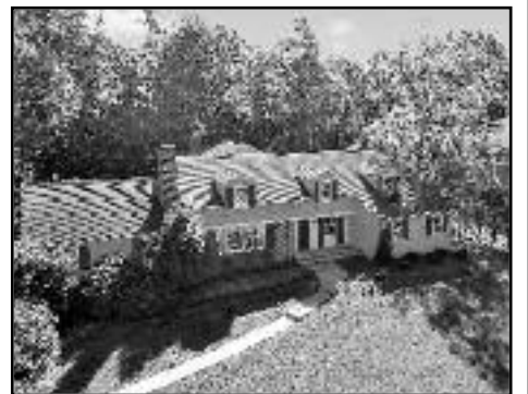
281 Hartshorn Dr, Millburn Offered at $1,585,000