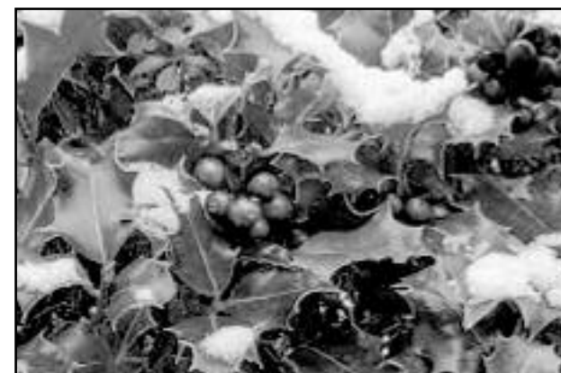
(above) Hollies provide food, shelter and protection for birds all year long.