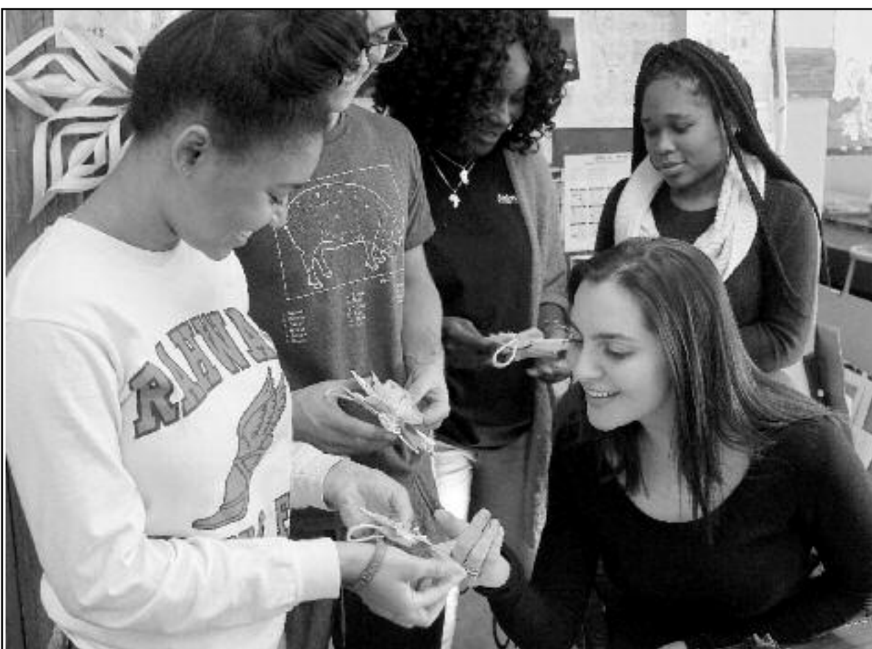
(above) Rahway Art Students.