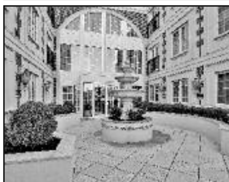
111 Prospect St, Unit 2A, Westfield Offered at $749,000