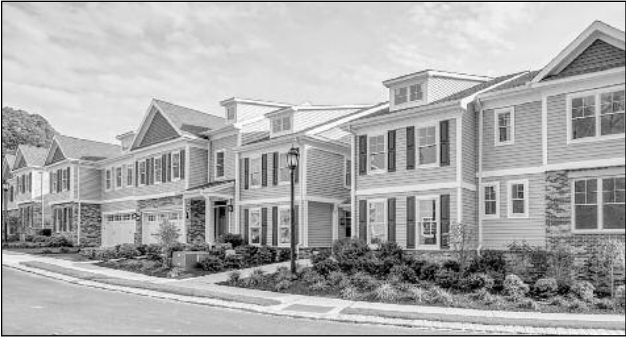
Echo Ridge Townhomes Grand Opening