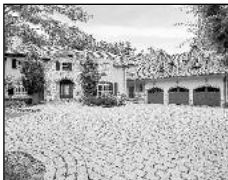
1235 Cooper Rd, Scotch Plains Offered at $1,749,900