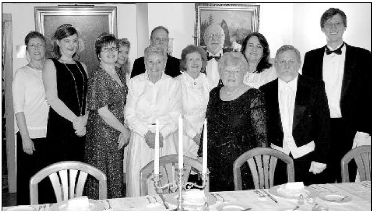
(above) Costumed members of the Mountainside Historic Committee await their dinner guests for last year's Downton Abbey dinner at the Hetfield House.

Presented by the volunteers of the Mountainside Historic Committee, space for this Flappers & Bootleggers Roaring '20s Speakeasy Social is limited and any interested adults should call for reservations immediately. The cost is $75 per person. Full payments are due within one week of reservation. Reservation forms can be found at the Mountainside Library, Borough Hall, at mountainsidehistory.org or by calling (908)789-9420.