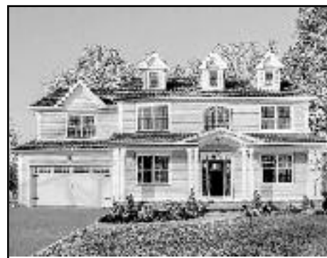
512 Bradford Ave, Westfield Offered at $1,625,000