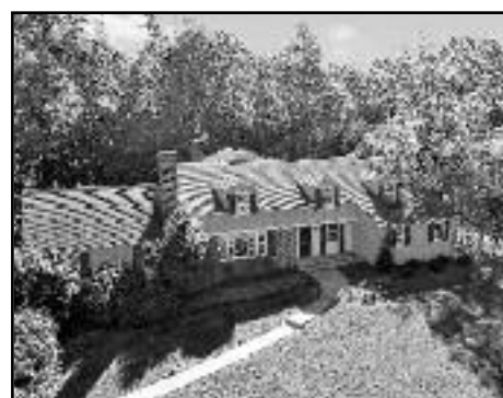
281 Hartshorn Dr, Millburn Offered at $1,585,000