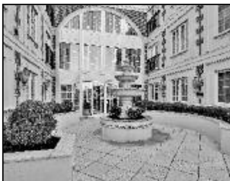
111 Prospect St, Unit 2A, Westfield Offered at $749,000