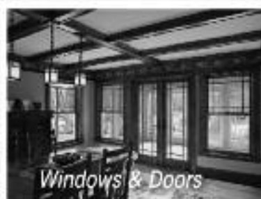
Windows & Doors