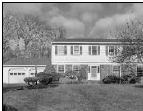
917 Tice Place, Westfield Offered at $895,000