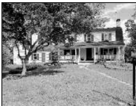
24 Tanglewood Ln, Mountainside Offered at $795,000