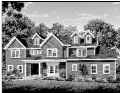
110 Wychwood Rd, Westfield Offered at $1,849,900

Visit ThelsoldiCollection.com or call 908-787-5990