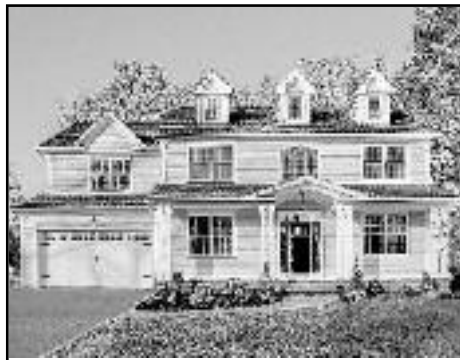
512 Bradford Ave, Westfield Offered at $1,625,000