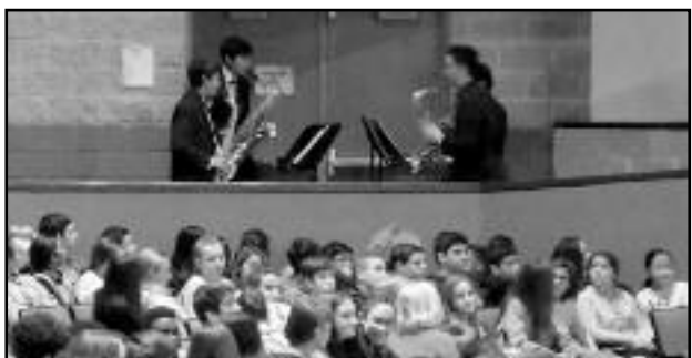
(above) During a break in the main performance space, which gave production crews an opportunity to rearrange chairs and music stands for instrumental bands, a smaller musical group of student musicians, The Sax Quartet, occupied the interest of the audience by performing several jazzy numbers. Among them was, appropriately, "Take Five," Dave Brubeck's best-known composition