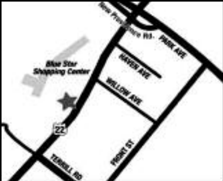
Large Parking Lot to Accommodate our Customers

10% DISCOUNT Seniors 60+, Military, Police, College Students Hibachi Grill Supreme Buffet (Show ID)