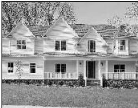
225 Golf Edge, Westfield Offered at $1,799,000