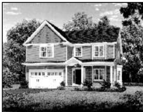
115 Ayliffe Ave, Westfield Offered at $1,095,000