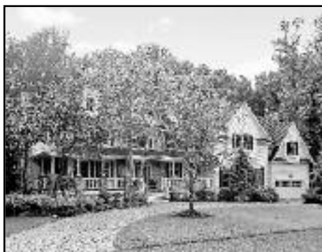
1231 Cooper Rd, Scotch Plains Offered at $1,450,000