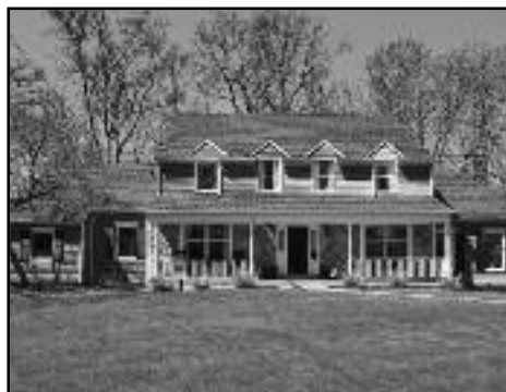
233 Connecticut St, Westfield Offered at $899,900