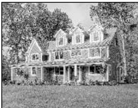
1741 Cooper Rd, Scotch Plains Offered at $1,379,000