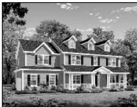
35 Plymouth Rd, Westfield Offered at $1,600,000