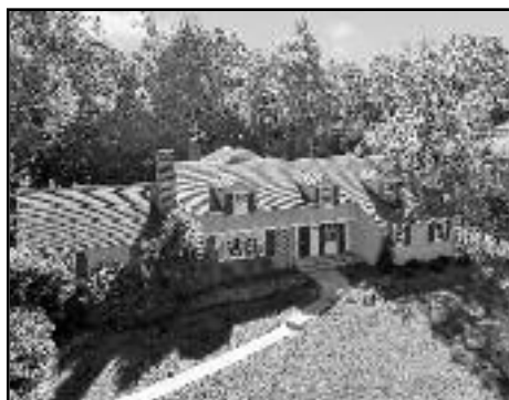
281 Hartshorn Dr, Millburn Offered at $1,585,000