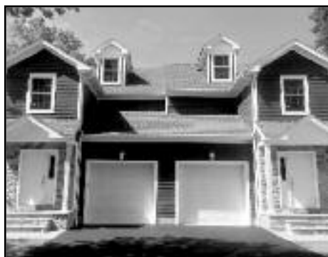
109 Palsted Ave, Unit 1, Westfield Offered at $599,900