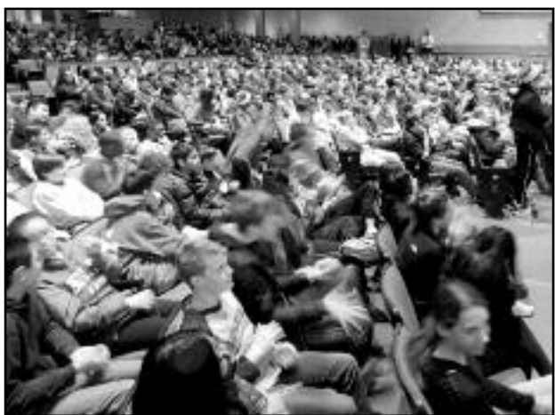
(above) Eighth grade students from Middle School in Warren Township, Long Hill Township, Watchung and Green Brook Township, all soon-to-be First Year high school students, were the guests of honor at the 2017 Middle School Choral & Instrumental Concert, December 22, 2017, at the WHRHS Performing Arts Center (PAC).

being able to feel "Warrior Pride" as the future Watchung Hills Regional High School (WHRHS) Class of 2022.