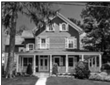
630 Clark Street, Westfield Offered at $1,485,000