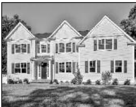
12 Manchester Dr, Westfield Offered at $1,599,000