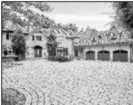
1235 Cooper Rd, Scotch Plains Offered at $1,749,900