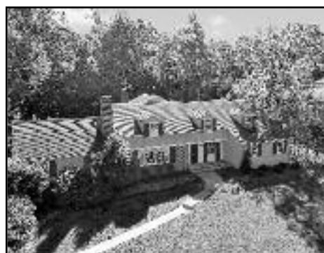
281 Hartshorn Dr, Millburn Offered at $1,585,000