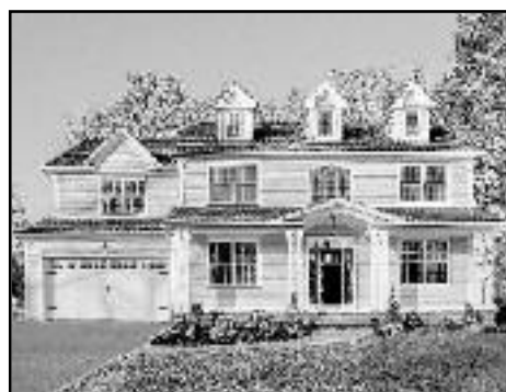
512 Bradford Ave, Westfield Offered at $1,625,000