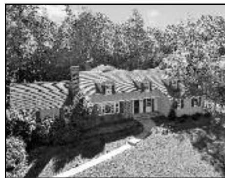
281 Hartshorn Dr, Millburn Offered at $1,585,000