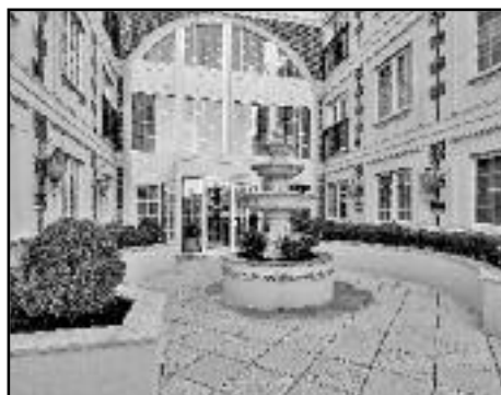
111 Prospect St, Unit 2A, Westfield Offered at $749,000