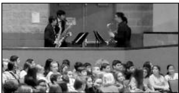
(above) During a break in the main performance space, which gave production crews an opportunity to rearrange chairs and music stands for instrumental bands, a smaller musical group of student musicians, The Sax Quartet, occupied the interest of the audience by performing several jazzy numbers. Among them was, appropriately, "Take Five," Dave Brubeck's best-known composition.