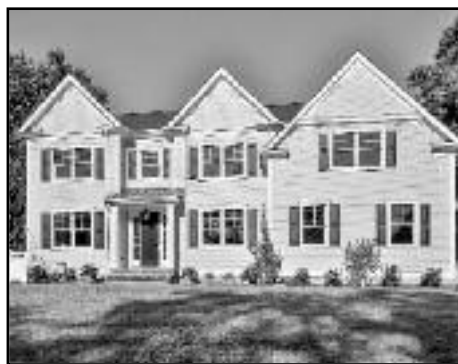
12 Manchester Dr, Westfield Offered at $1,599,000