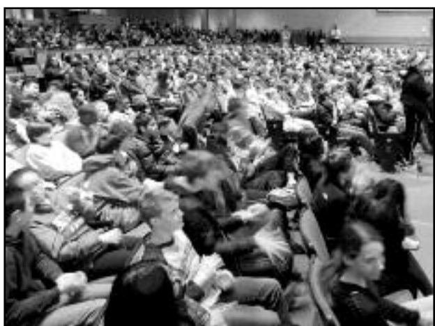
(above) Eighth grade students from Middle School in Warren Township, Long Hill Township, Watchung, and Green Brook Township, all soon-to-be First Year high school students, were the guests of honor at the 2017 Middle School Choral & Instrumental Concert, December 22, 2017, at the WHRHS Performing Arts Center (PAC).

their middle school career, they do so having received the gift, three days before Christmas, of being able to feel "Warrior Pride" as the future Watchung Hills Regional High School (WHRHS) Class of 2022.