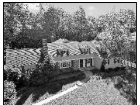
281 Hartshorn Dr, Millburn Offered at $1,585,000