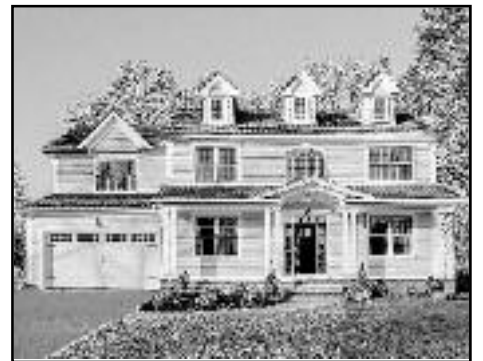
512 Bradford Ave, Westfield Offered at $1,625,000