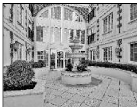
111 Prospect St, Unit 2A, Westfield Offered at $749,000