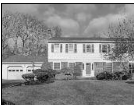
917 Tice Place, Westfield Offered at $895,000