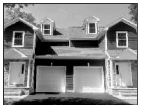
109 Palsted Ave, Unit 1, Westfield Offered at $599,900