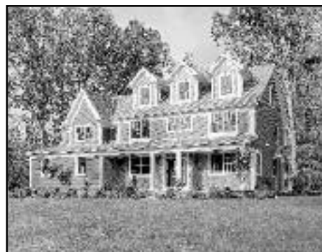
1741 Cooper Rd, Scotch Plains Offered at $1,379,000