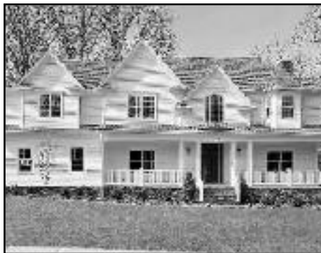
225 Golf Edge, Westfield Offered at $1,799,000