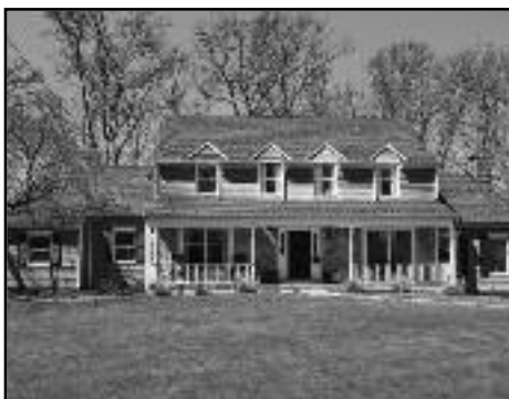
233 Connecticut St, Westfield Offered at $899,900