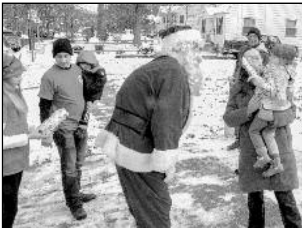
(above) Santa delivers a present to a little girl on LaGrande Avenue.