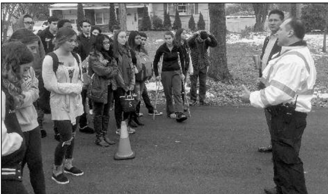
(above) Students participating in a Q&A session after the reenactment.