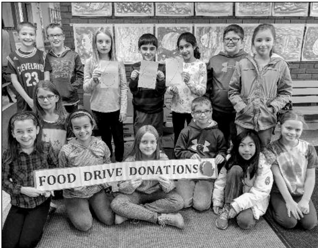
(above) Thanksgiving Food Drive 2017.

total of 662 food items were collected and organized for delivery to the Salvation Army of East Orange. The school is proud to serve the needs of their surrounding communities and spread kindness to others.