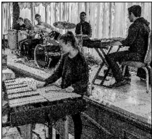
(above) The Moonglowers from Scotch Plains/Fanwood High School played holiday tunes.