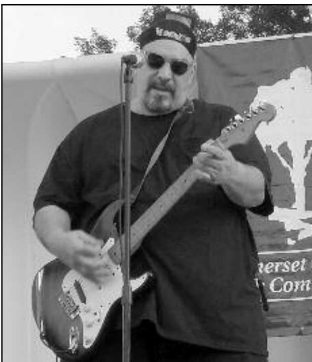
(above) Pat DiNizio performing at Duke Island Park, Bridgewater, New Jersey, 2013.

Condolences to his family, close friends, and bandmates. DiNizio's music will live on in our hearts – much more than "a memory."