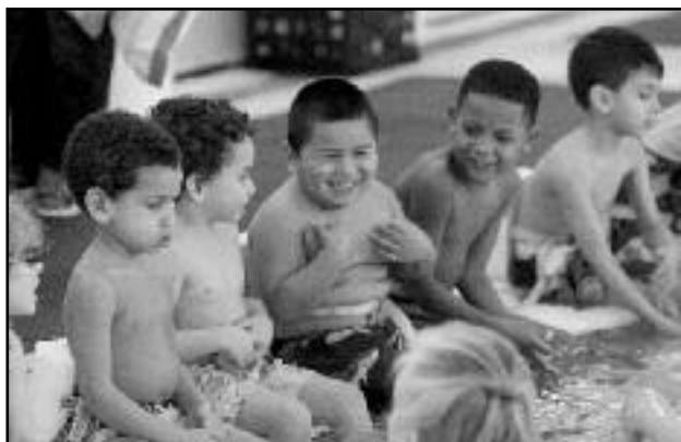
(above) Young Union residents enjoying the Five Points Branch pool.