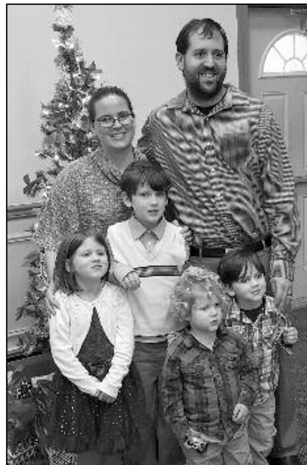
(above) Comerford Family picture.

Discover KYBELLA®, the first and only FDA-approved injectable treatment to reduce fat under the chin.