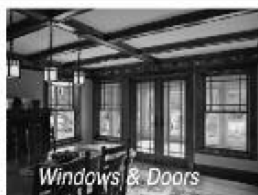
Windows & Doors