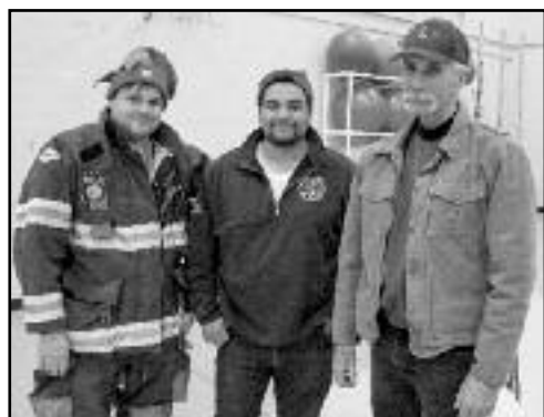
(above) The Stirling Fire Department delivered Santa safely to the event.