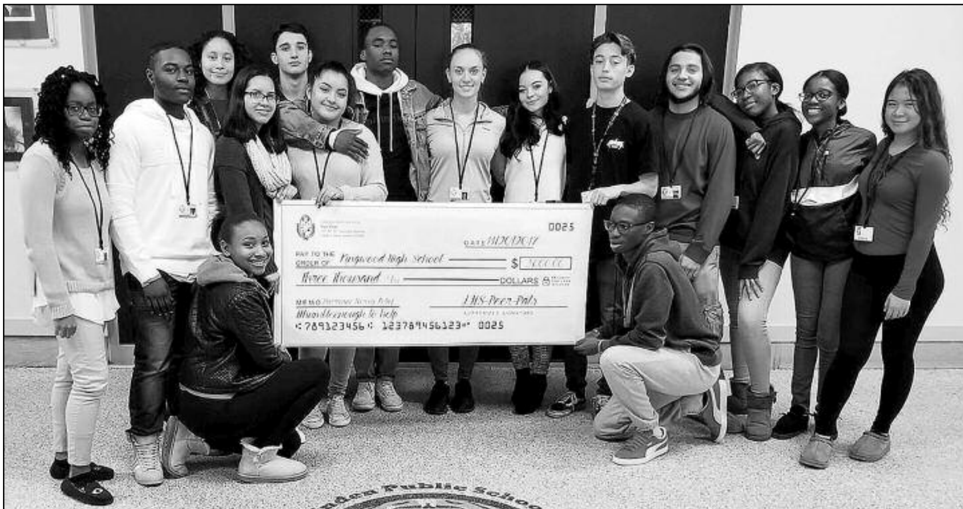
(above) Students from the Linden High School Peer Pals Class holding a check for $3,000 for Kingwood High School in Humble, Texas.

"During the beginning days of this initiative, our story made the local news and newspapers, which brought great support from people everywhere," the Peer Pals statement said. "Through the assistance of our LPS family, local and surrounding communities, and outreach from around the state and country, we were able to raise $3,000! The money collected through this fundraiser will assist Kingwood High School in their efforts to put their school back together."