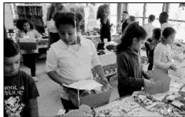
(above) School No. 4 children shopping at the Winter Wonderland gift shop.