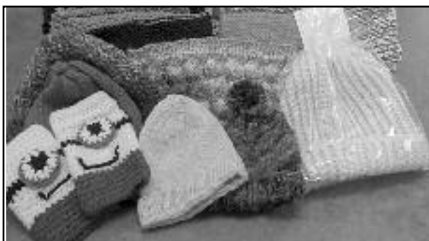
(above) Kenilworth Library "Yarnies" donated handmade items to help keep people warm.

Our next meeting is planned for Thursday, January 25, 2018.