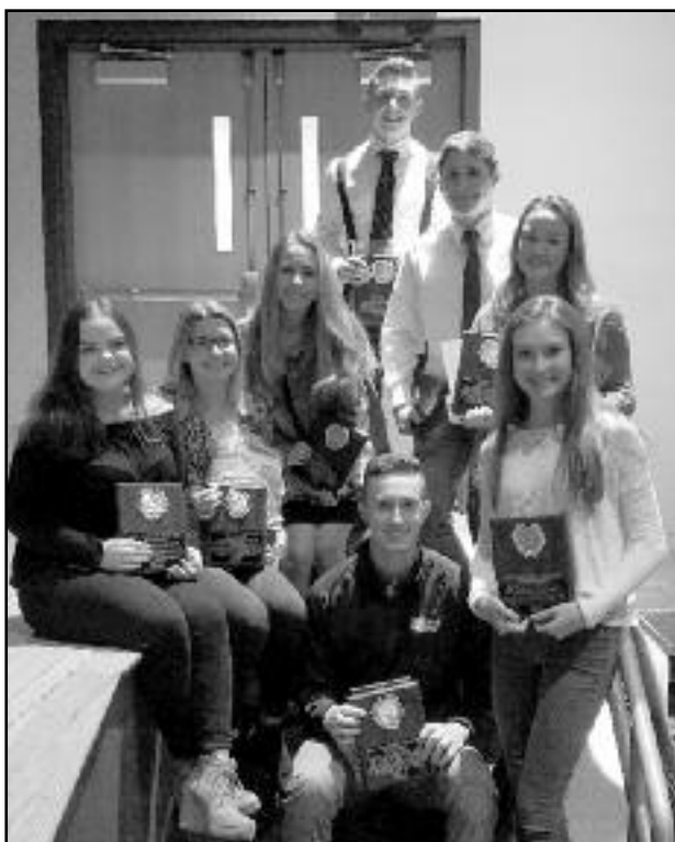
(above) 2017 Fall BTAs