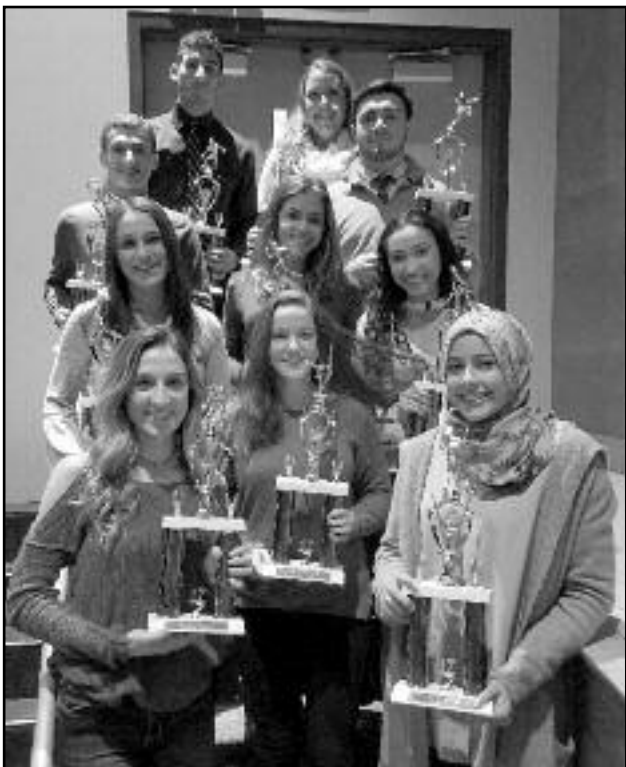
(above) 2017 Fall MVPs