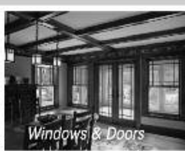
Windows & Doors