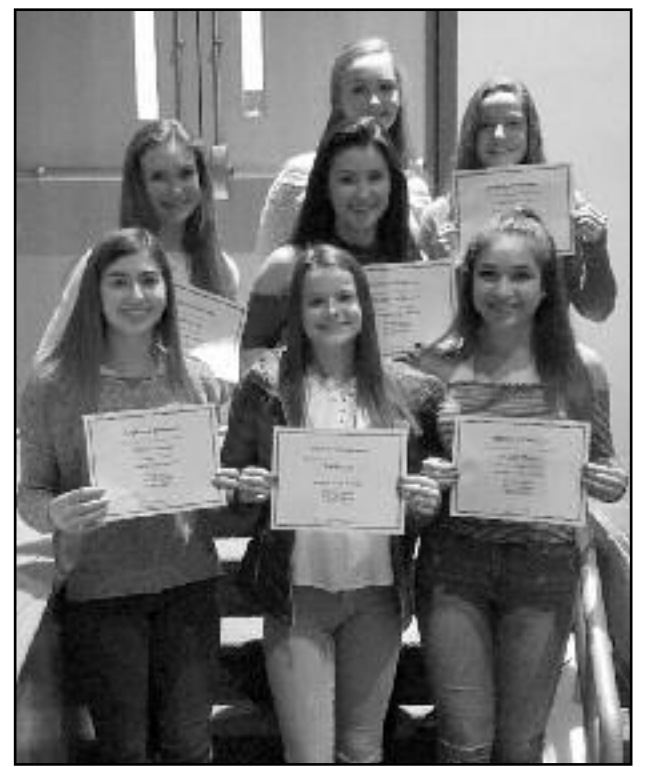
(above) 2017 Fall GPA Winners – Gymnastics Program.