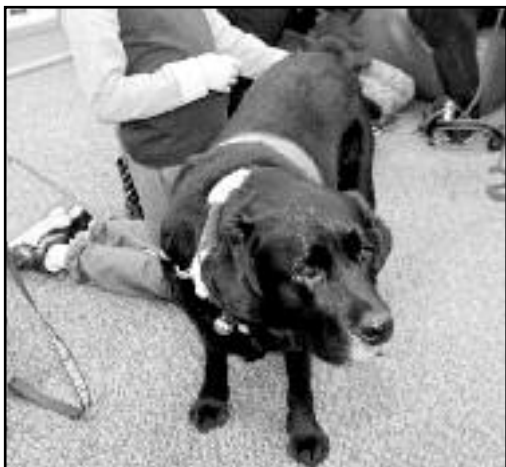
(above) Therapy dog, Finn.

Chathams, they've hosted the program for many years after hearing of the benefits that reading to a therapy dog can have on children. She stated, "Studies have shown that children find it easier and have more confidence and less anxiety with reading aloud to a pet who cannot judge them or make them feel bad if they make a mistake." The featured dogs last month were Zelda, a Miniature Poodle; Brie, a Maltese; and Finn, a Black Labrador Retriever.