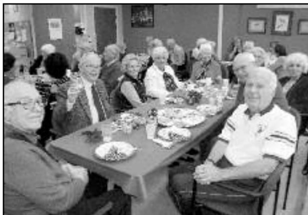
Seniors enjoying the holiday party.