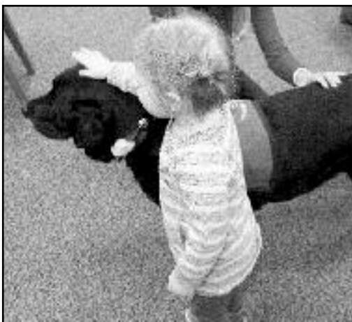
(above, l-r) Therapy dogs Zelda and Brie.

PRSR STD U.S. POSTAGE PAID PHILA PA 191 PERMIT NO.7575 ECRWSS