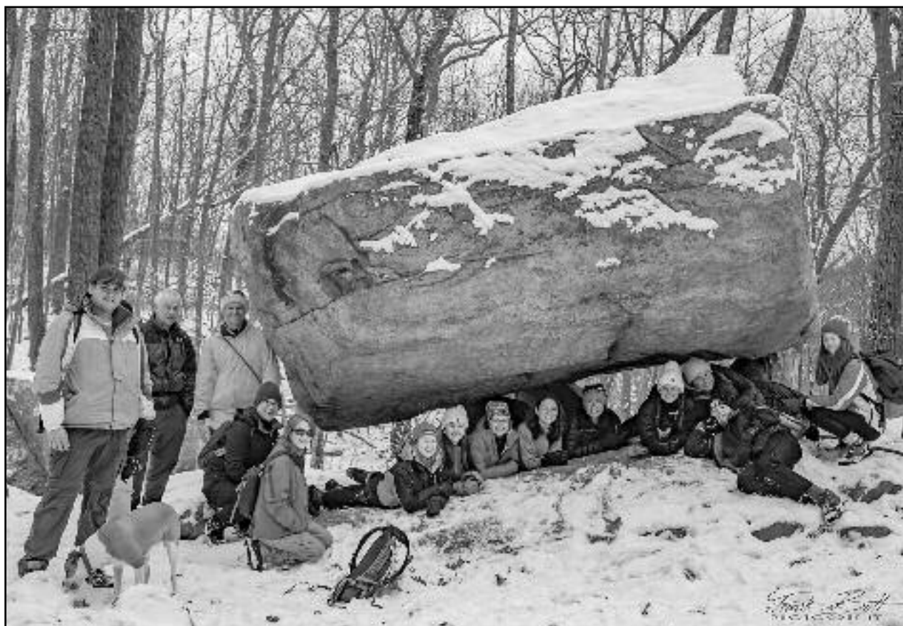
(above) Crew 28 under Tripod Rock on Pyramid Mountain.

For information about Crew 28, contact chathamcrew28@gmail.com . For more information on Venturing youth and adult programs, visit: https://www.scouting.org