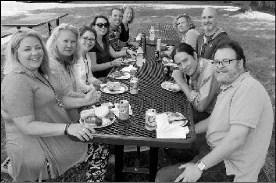
(above Among the teachers who sat outside courtyard next to the south cafeteria at the Luncheon BBQ are members of the English Department.