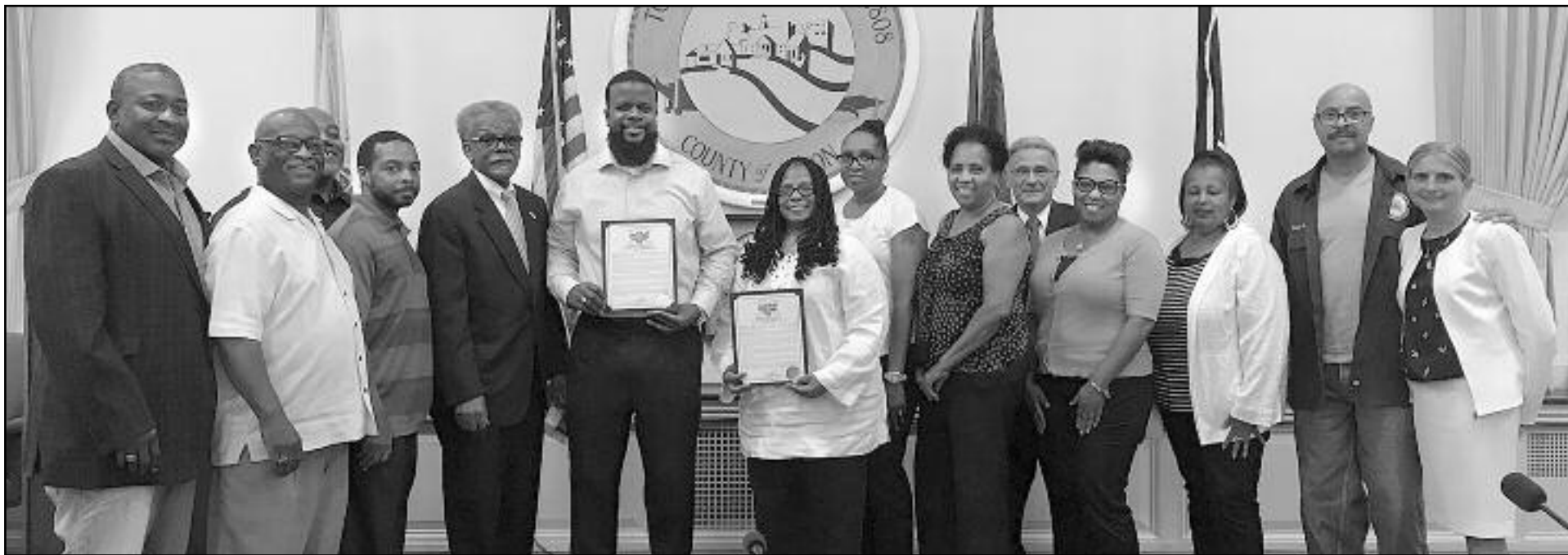
(above) Members of Golden Rule Lodge No. 24 and Golden Rule Chapter No. 50 with the Mayor and Committee Members of the Township of Union.