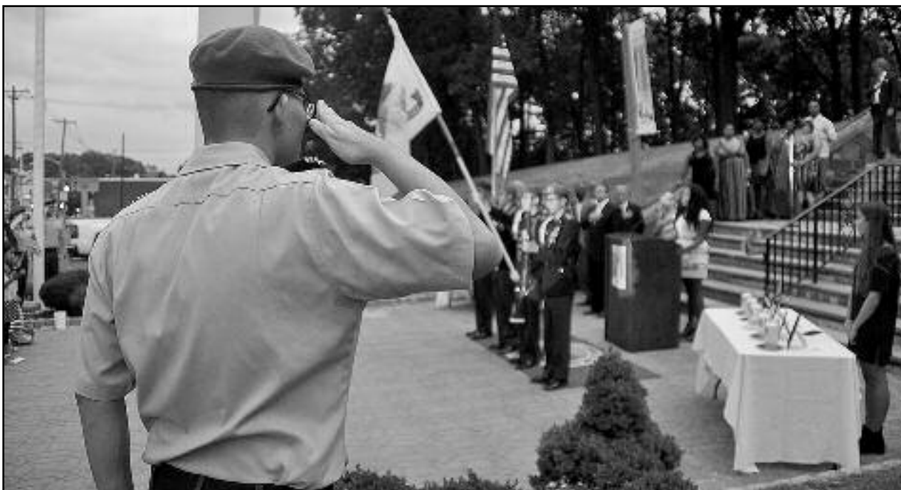
(above) Image from the Township of Union 2016 September 11th Remembrance Ceremony. This year's ceremony will take place at Union Fire Headquarters located on Bond Dr. beginning at 8:15 a.m.

For additional Information please contact the Township of Union Office of Public Information at 908-851-5096 or via email at publicinfo@uniontownship.com .