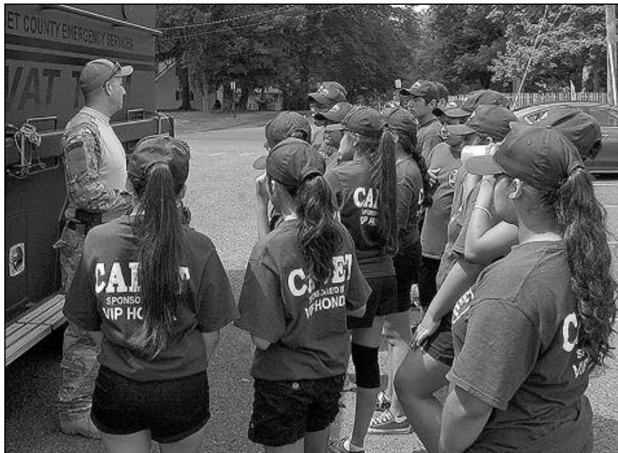
(above) Youth academy participants learning about the Somerset County Swat Team.

Business Professionals, Entrepreneurs & Retirees... Would you like to help small businesses succeed? Become a SCORE mentor! Go to www.centraljersey.score.org to volunteer.