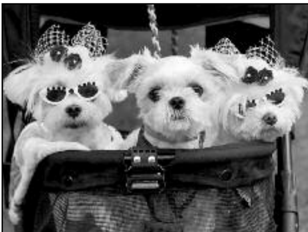
(above) "Bark-a-Que" is a pet-friendly event attracting hundreds of dog owners each year.

Home for Good Dog Rescue is a 100% foster-based, non-profit 501(c)(3) dog rescue established in 2010 in Summit, NJ with offices in Berkeley Heights, NJ. We rescue homeless dogs from high-kill shelters in the South, which are overflowing with unwanted dogs on the brink of being euthanized. We socialize, care for, and provide them life-saving medical care at our property in Aiken, SC, transport them to our rescue in New Jersey, and nurture them in our network of foster families while they await adoption into loving homes – giving them a second chance at life.