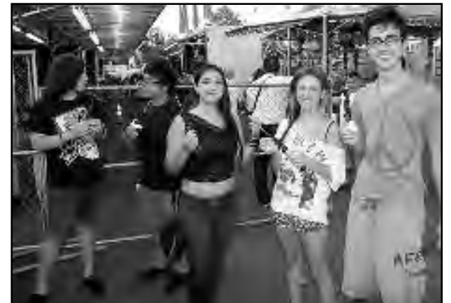
Photos of past Kenilworth Volunteer Fire Department Carnivals

Photos from these and other events can be found online at rennamedia.com and on the Kenilworth Business Life page on facebook.com . Feel free to "Like", "Tag" and "Share"