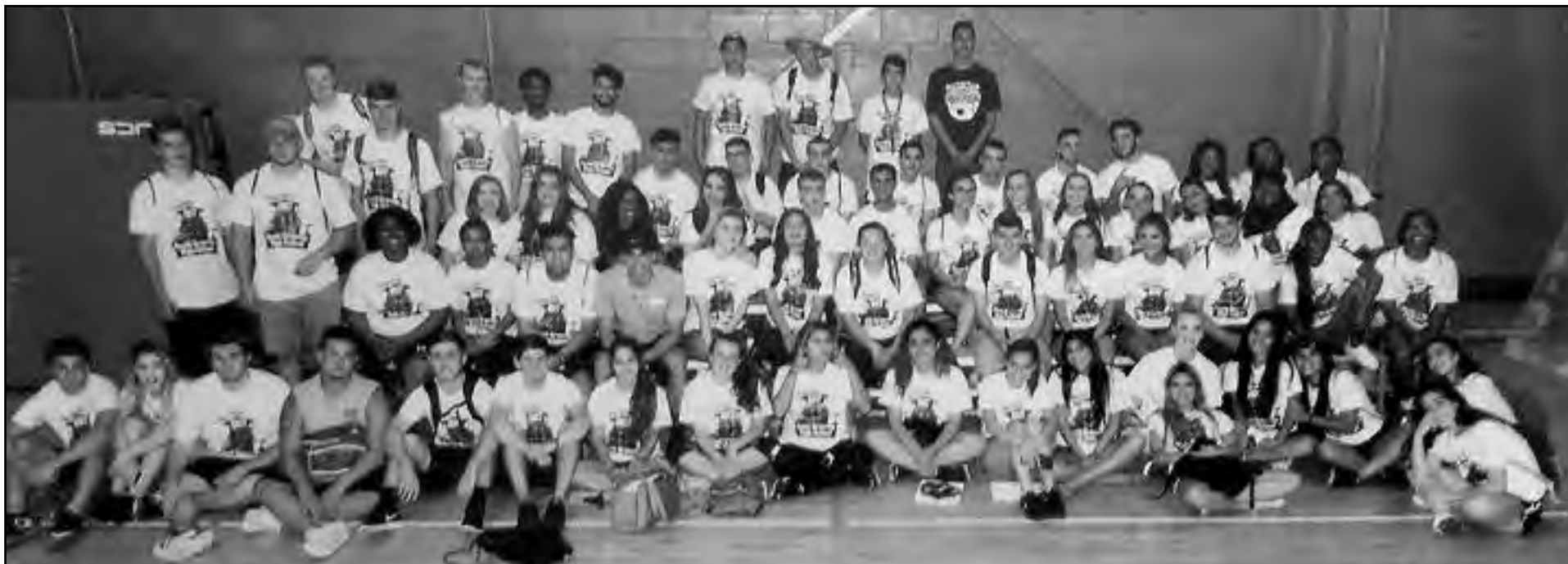
(above) The graduating class of 2017 at Project Graduation.

With the help of area businesses, David Brearley High School graduates celebrated graduation in a safe, alcohol- and drug-free environment, through the district's annual Project Graduation, held June 22, 2017 at Coastal Sports