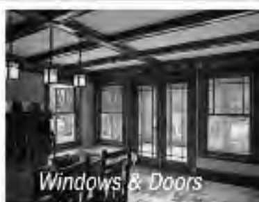
Windows & Doors