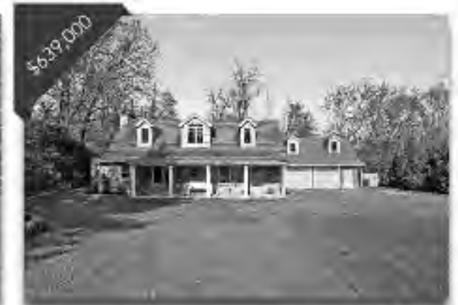
16 King George Road 3 Bedrooms, 3 Baths Raised Ranch on Over 2 Private Acres with Fabulous 4 Season Porch With Gas Stove. 16KingGeorge.com