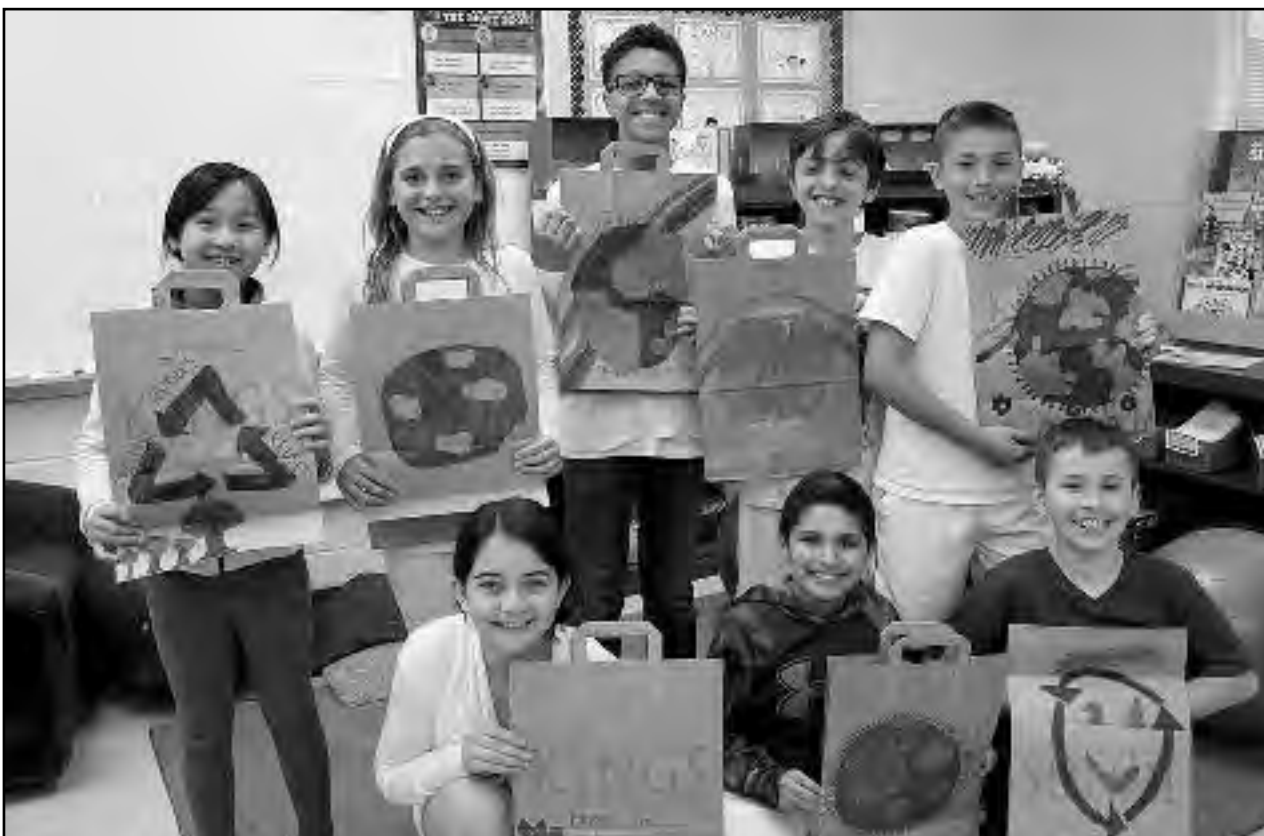
(above) ALT 5th graders spearheaded a schoolwide effort to decorate Kings shopping bags to increase awareness in the community.