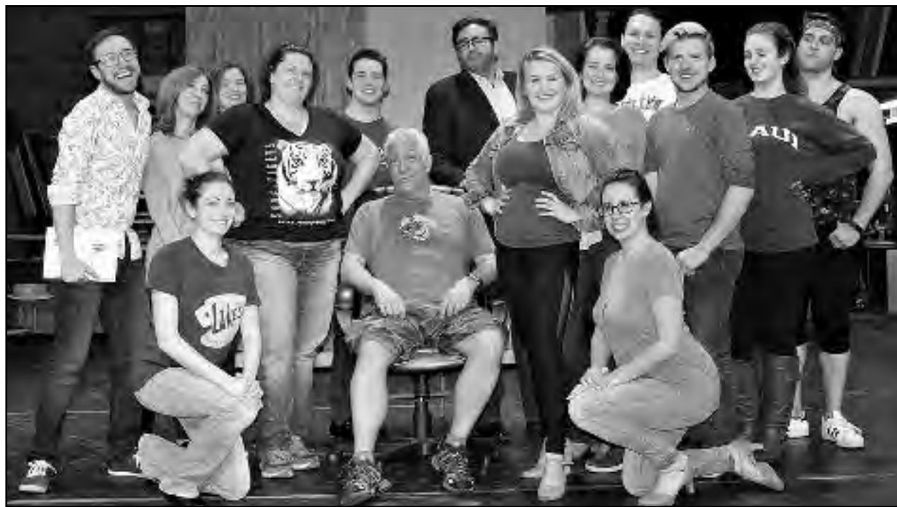
(above) The cast of 9 to 5 The Musical.

Funding has been made possible in part by the NJ State Council on the Arts, Dept. of State, a Partner Agency of the National Endowment for the Arts, through a grant administered by the Union County Office of Cultural & Heritage Affairs