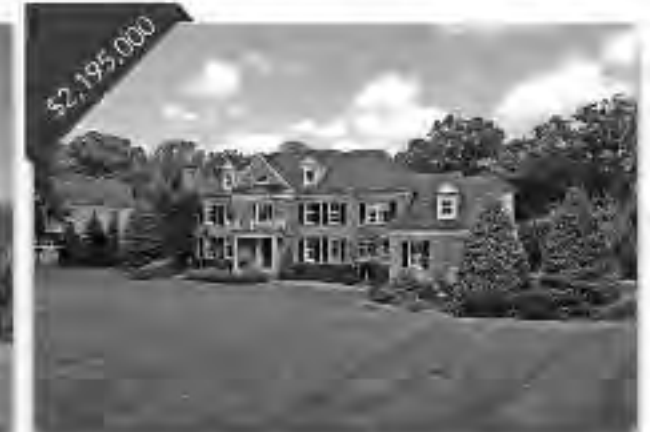
24 Raspberry Trail 5 Bedrooms, 5.1 Baths Beautiful Custom Brookside Manor Home with Many Custom Upgrades Throughout. 24Raspberry.com