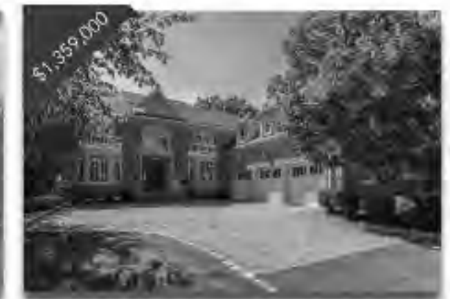
7 Strawberry Lane 5 Bedrooms, 4.2 Baths Beautiful Home in Desirable Neighborhood. Gourmet Kitchen and Expansive Lower Level. 7Strawberry.com