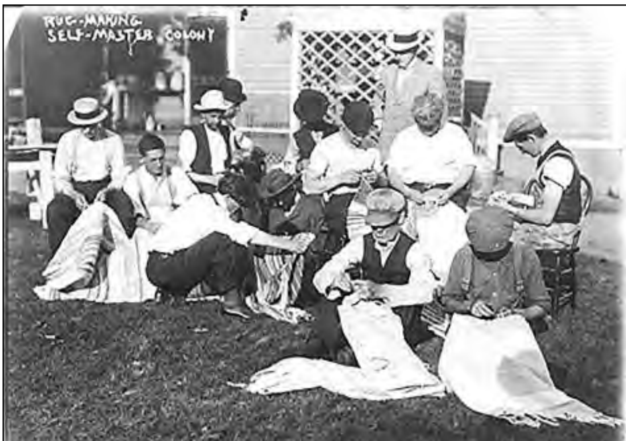
(above) Residents of the Self Master Colony in the early part of the 20th century learned trades, such as rug-weaving shown here, to become self-sufficient members of society.

Admission is free. Refreshments will be served. For more information, please call 908-851-5450.