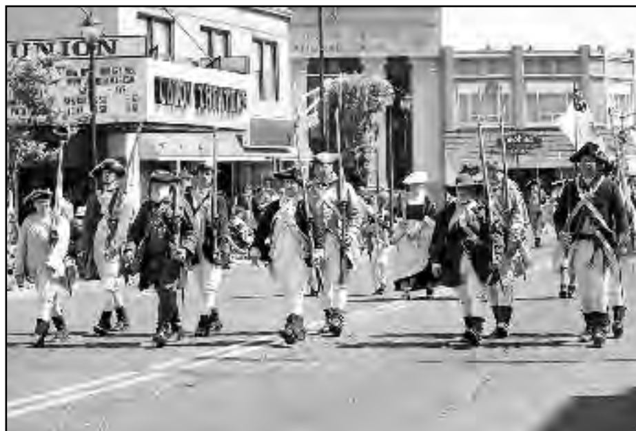
(above) War reenactors travel along the Township of Union Memorial Day Parade route. This year's parade will take place on Monday, May 29th at 10:00 a.m., departing from High St. and traveling along Stuyvesant Ave. in Union.

Residents are also encouraged to stop by Friberger Park, behind Town Hall, on May 28th