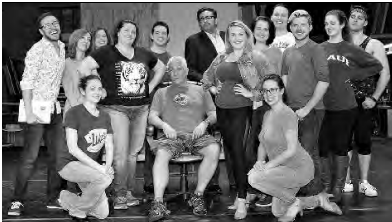
(above) The cast of 9 to 5 The Musical.

Funding has been made possible in part by the NJ State Council on the Arts, Dept. of State, a Partner Agency of the National Endowment for the Arts, through a grant administered by the Union County Office of Cultural & Heritage Affairs