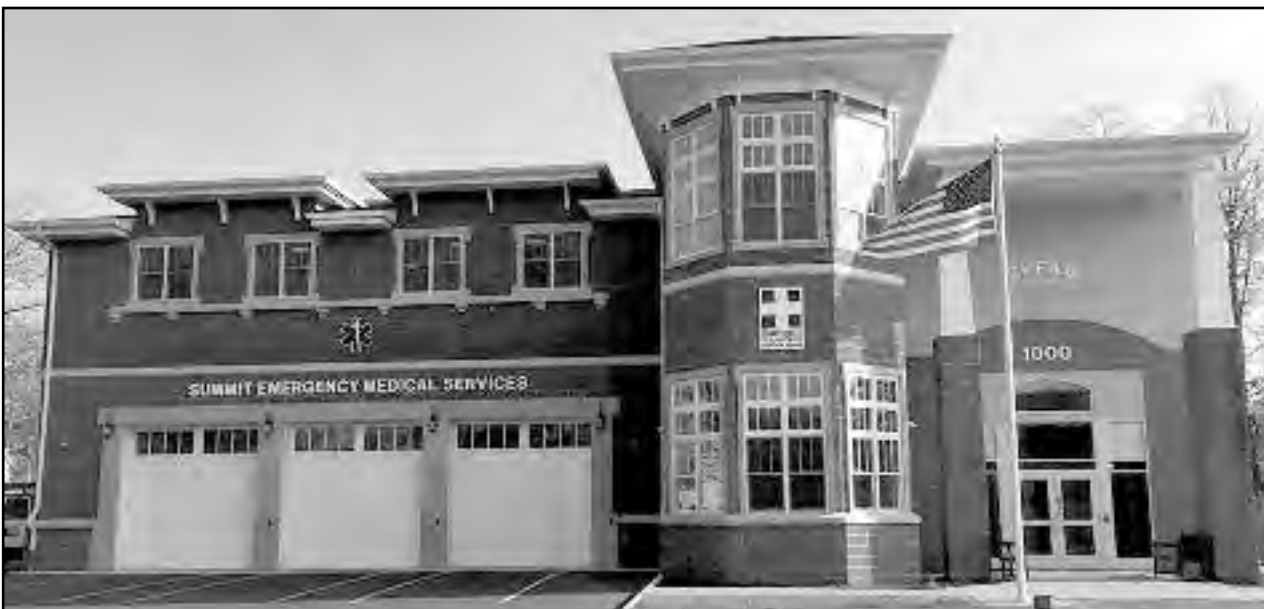
(above) First Aid Squad's new headquarters on Summit Ave. across from the Middle School.