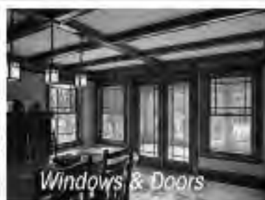
Windows & Doors